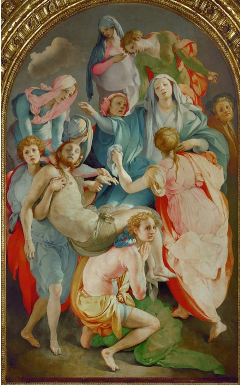
Figure 2 Pontormo. Descent from the Cross. 1525-1528. Oil on panel, 3.13 × 1.92 m. Capponi Chapel, S. Felicità, Florence.