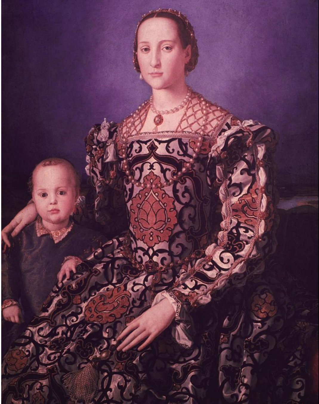
Figure 3 Bronzino, Agnolo, 1503-1572. Eleonora of Toledo with Son Giovanni . c.1544-5. Oil on wood, 115 x 96 cm. https://jstor.org/stable/community.13578725 .