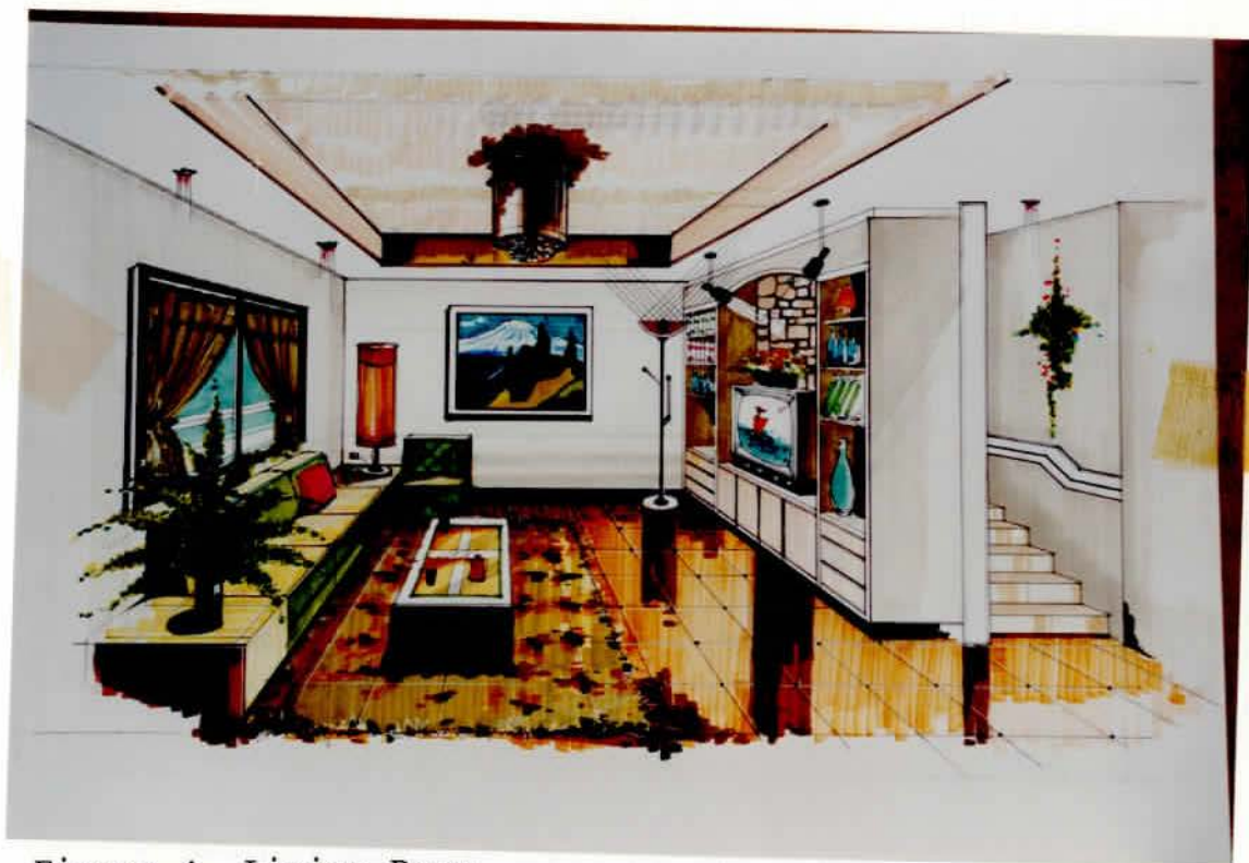
Figure 4. Living Room