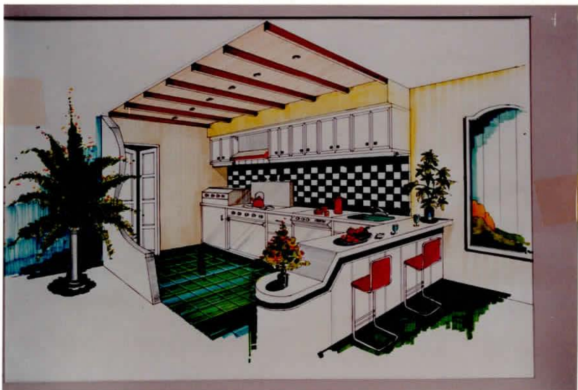
Figure 6. Kitchen