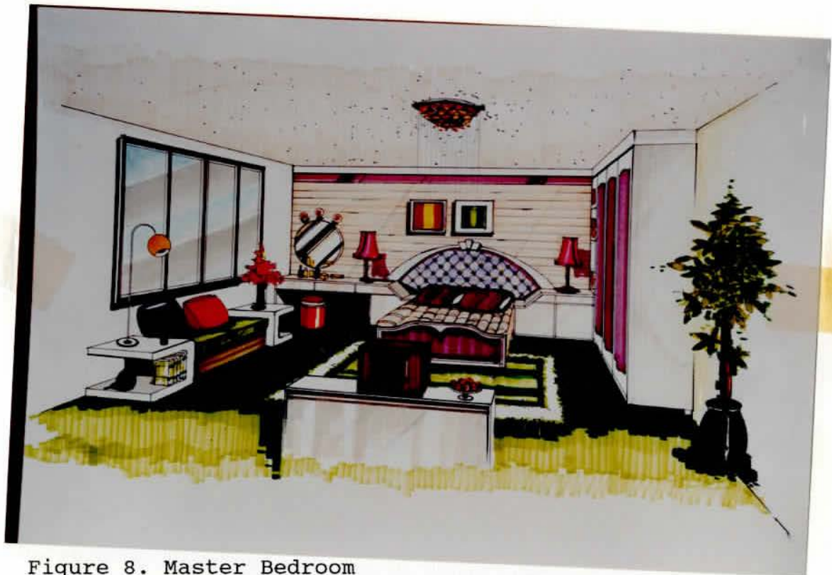
Figure 8. Master Bedroom