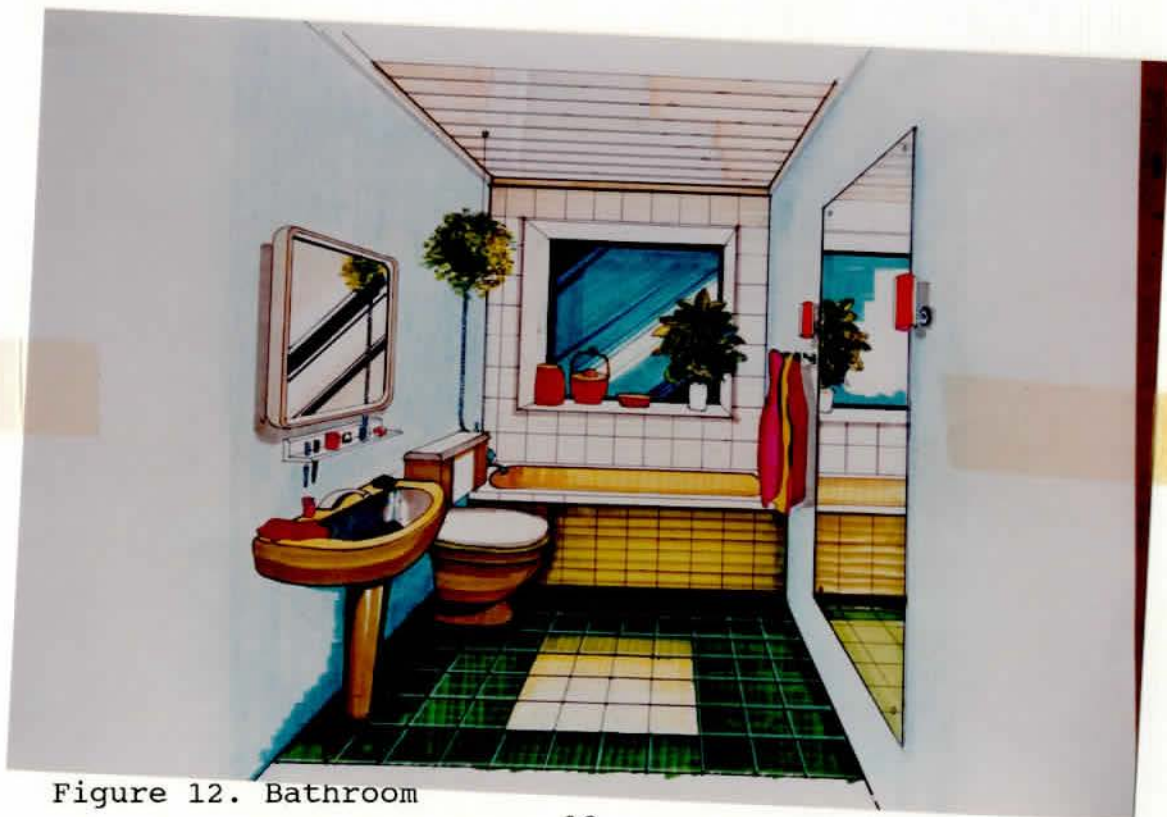
Figure 12. Bathroom