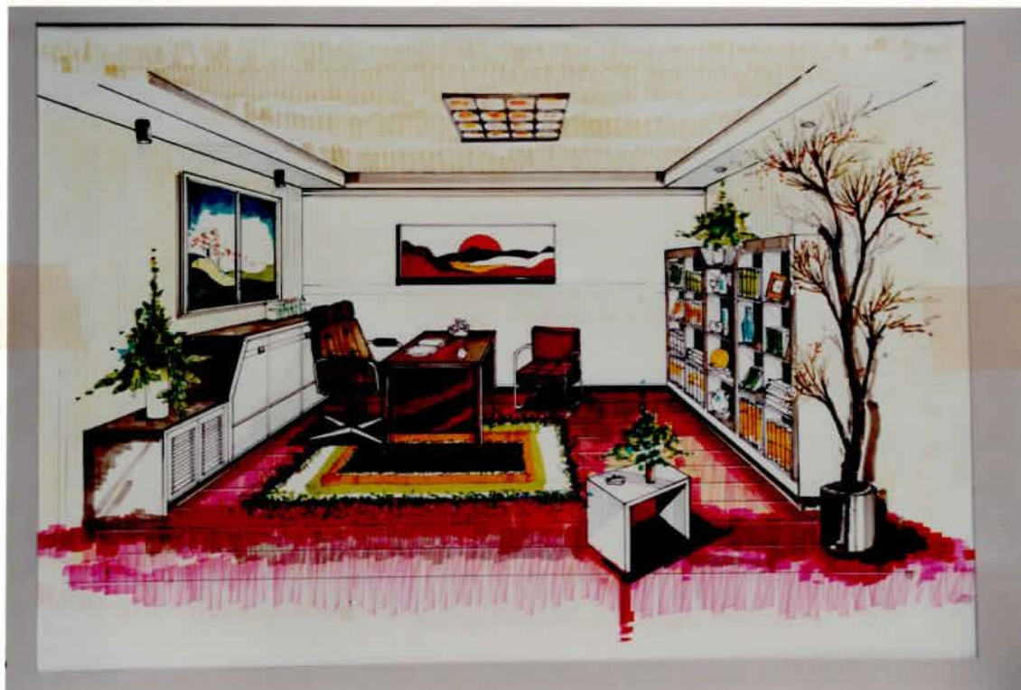
Figure 10. Study Room