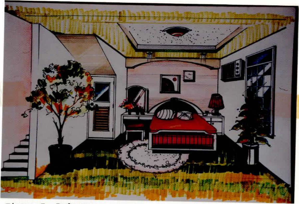
Figure 7. Bedroom