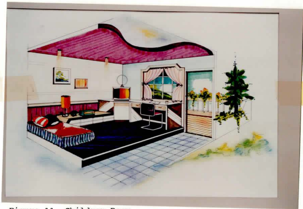
Figure 11. Children Room