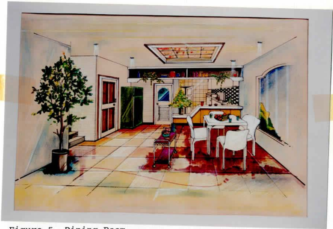
Figure 5. Dining Room