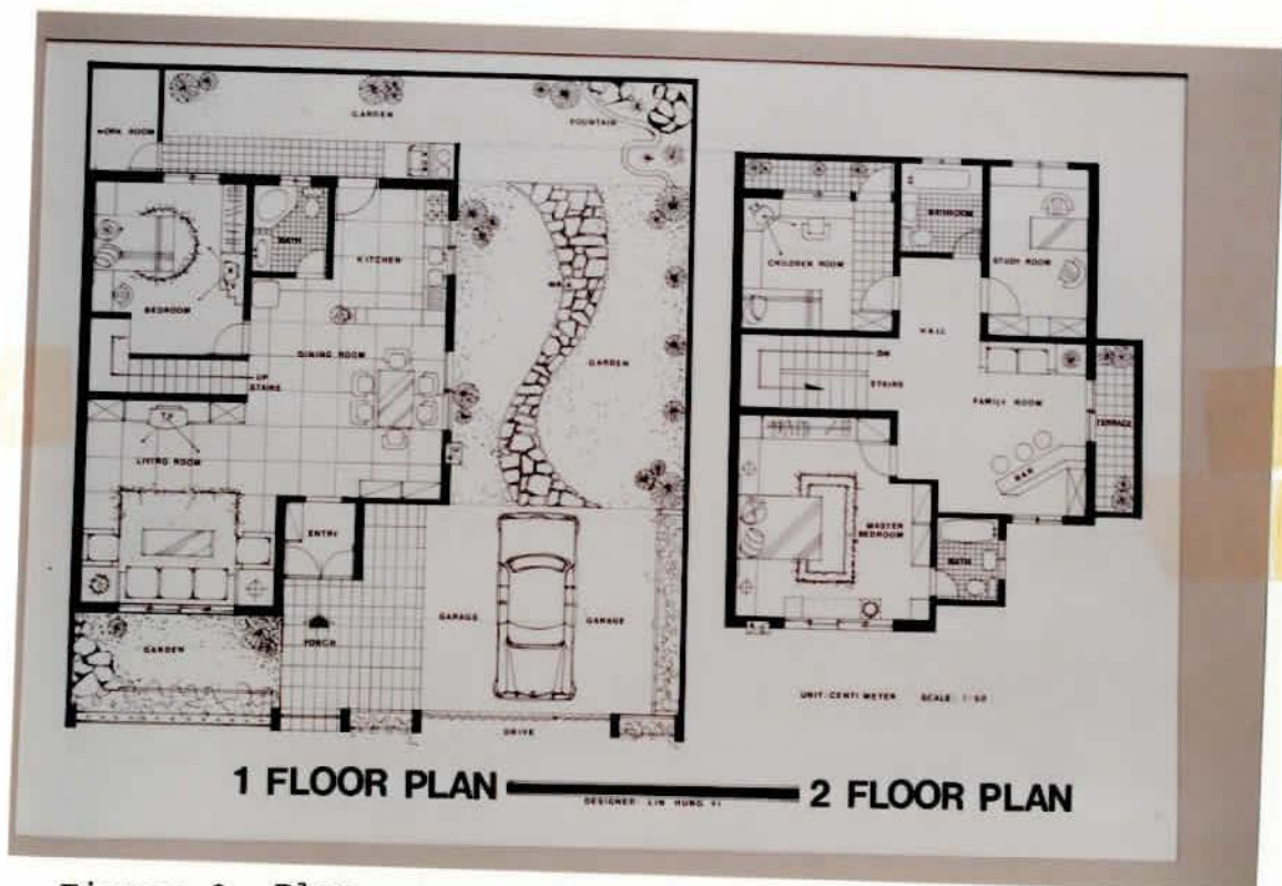
Figure 2. Plan