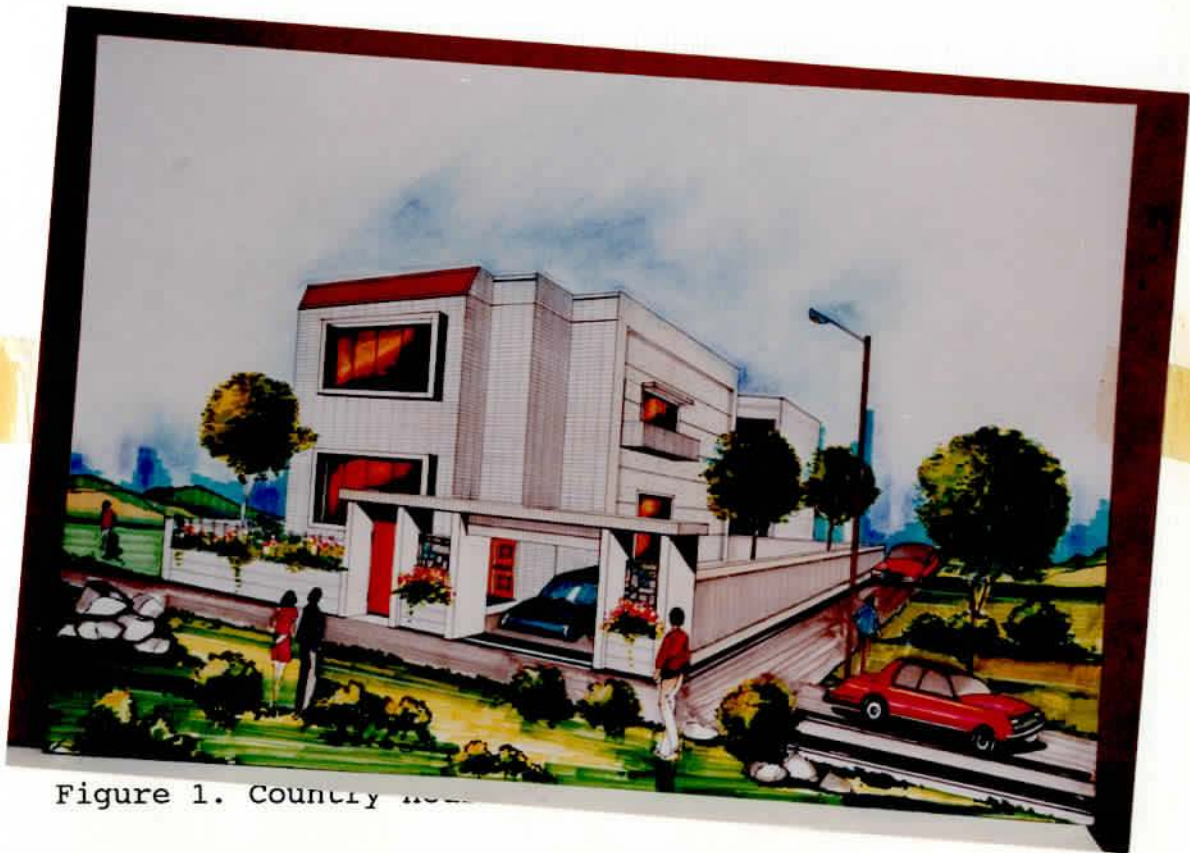
Figure 1. Country house