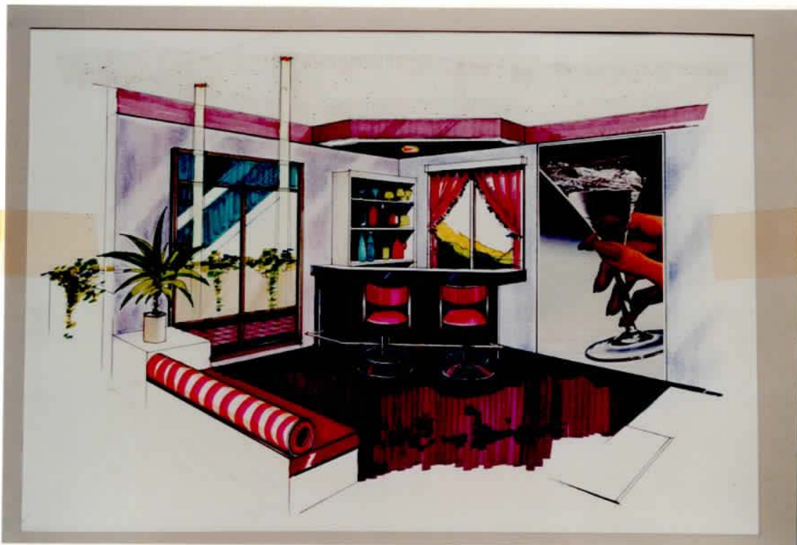
Figure 9. Family Room