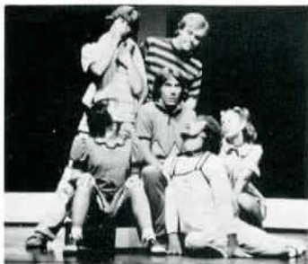
YOU'RE A GOOD MAN CHARLIE BROWN