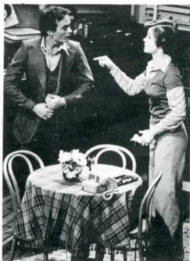
WAIT UNTIL DARK