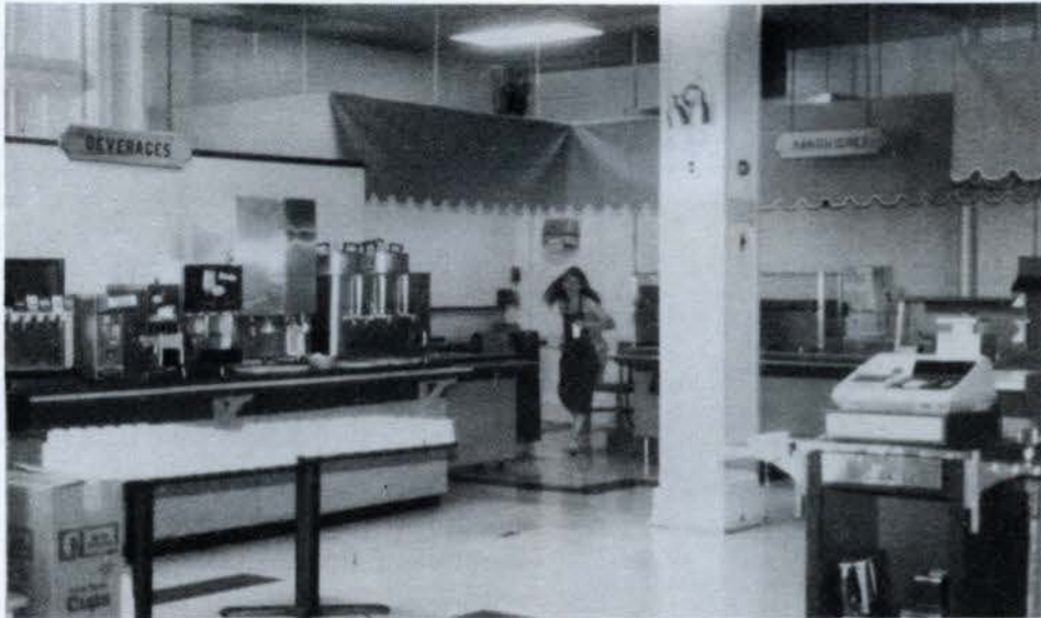
More pizzazz, more yums and more room for your meals.