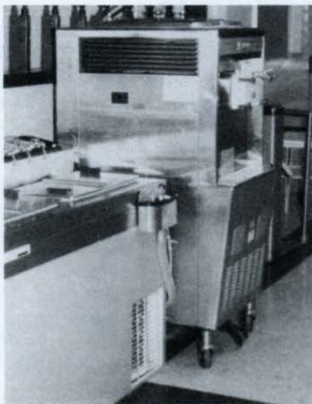
"R2D2" dispenses ice cream that's out of this world.

Mouth-watering aromas are headed for the Lindenwood College dining hall. No, that's not a statement from Ripley's Believe It Or Not. It's true. A new food service company, American Food Management (AFM), is making an investment of approximately $60,000 to improve student food services and the dining hall. Yum!