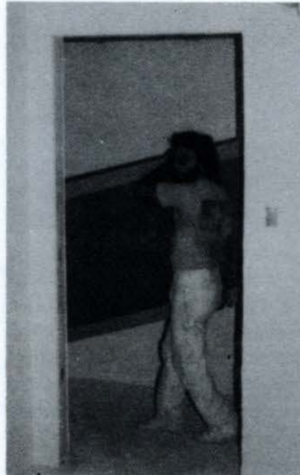
So this is what they mean by "room and board."