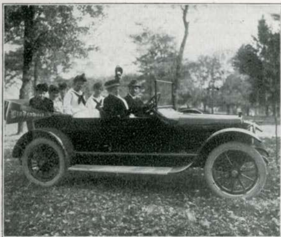
THE PRESIDENT'S NEW AUTO.