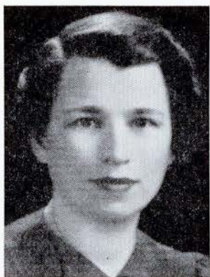
Dr. Jessie Bernard