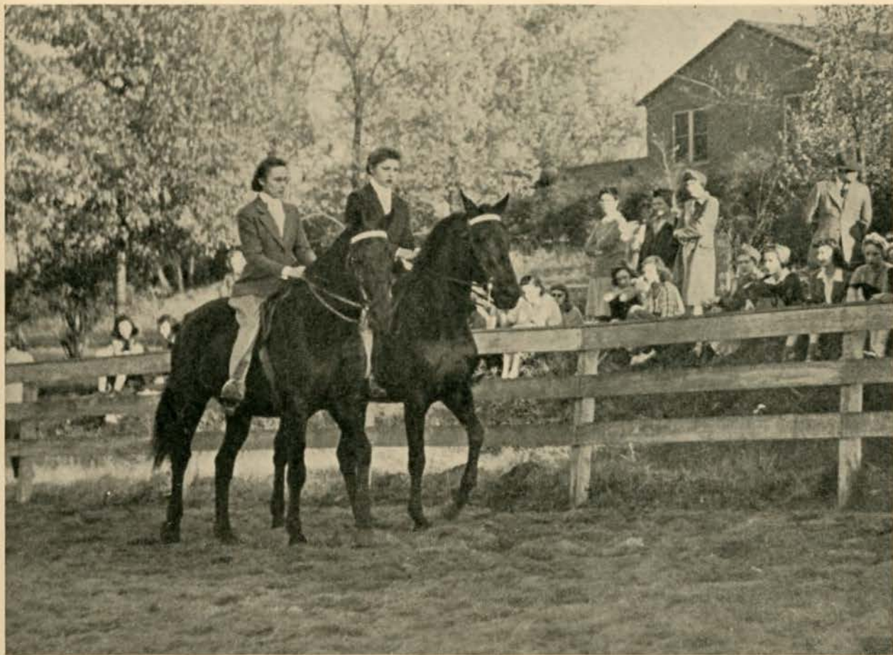
Spring brings a renewed interest in outdoor activities at Lindenwood. This is a familiar scene at the stables as the students practice for the annual college horse show.