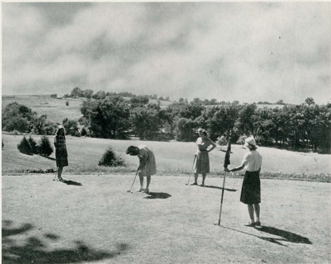
Autumn's gorgeous colors beckon on Lindenwood's golf course in October and November. Golf is a favorite fall sport at Lindenwood.