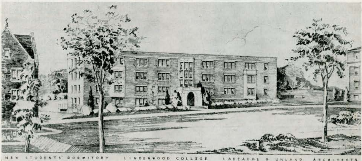
NEW STUDENTS' DORMITORY LINDENWOOD COLLEGE LABEAUME & UNLAND ARCHITECTS

This architect's drawing depicts the front view of the new residence hall to be built on the campus this spring and summer. It is planned to have the building ready for the opening of school next fall.