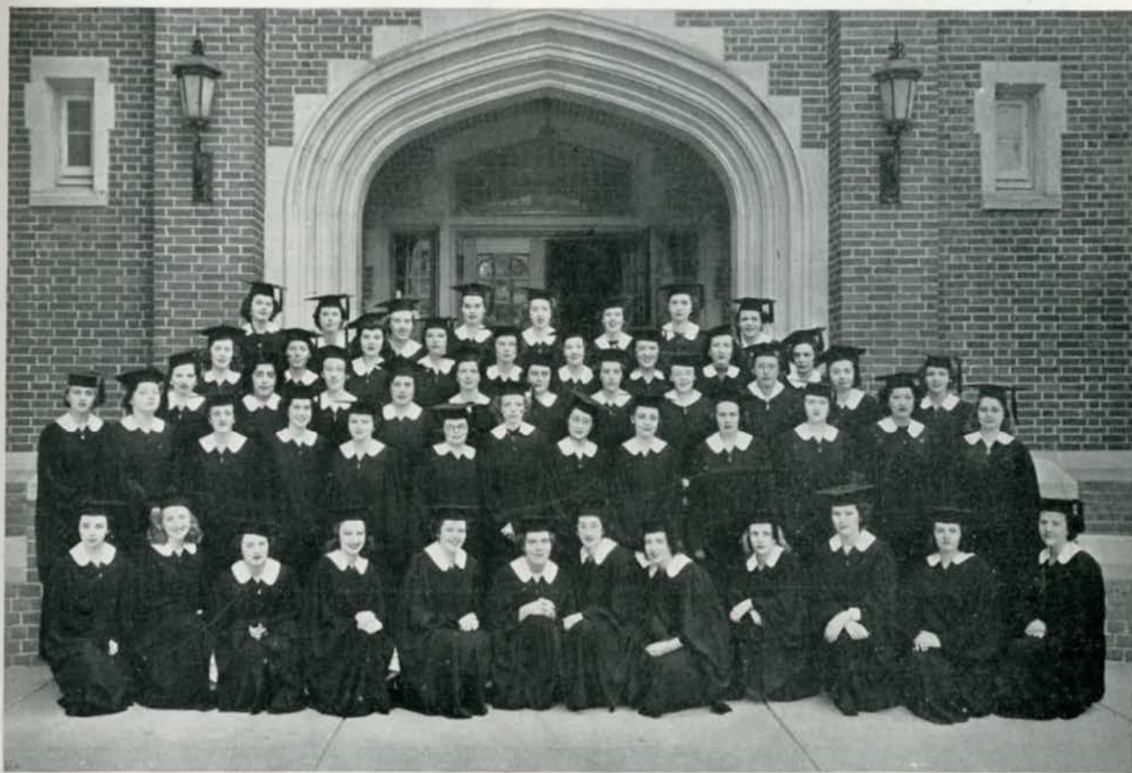
The Class of '49. Members of this year's graduating class posed for this picture on the steps of Roemer Hall after receiving their degrees on May 30 at the college's 122nd annual commencement.