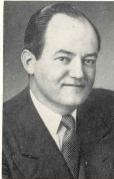
United States Senator Hubert H. Humphrey of Minnesota