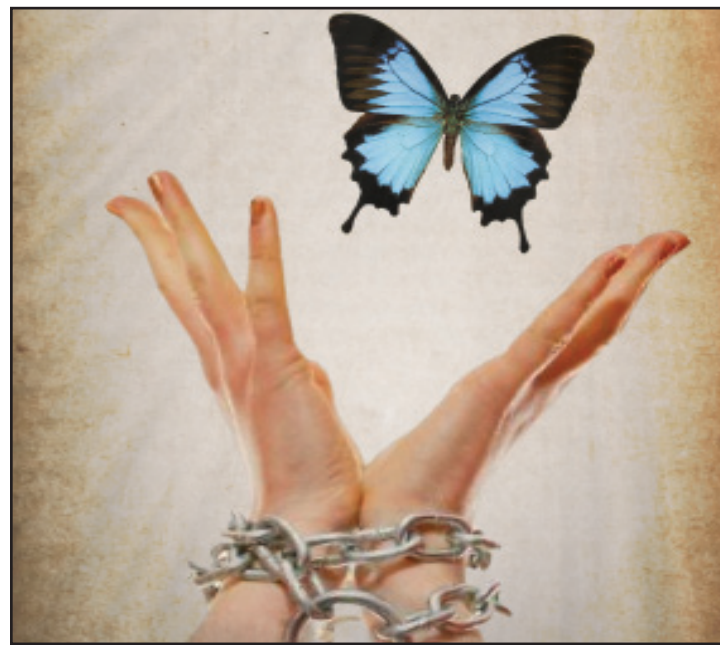
Artwork from the poster for the upcoming performance of "John and Jen" in the Jelkyl Theater from May 2-4.