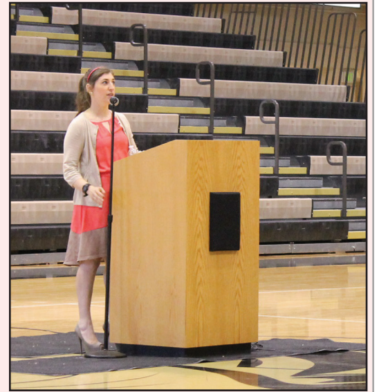
Mayim Bialik of The Big Bang Theory spoke to Lindenwood students in the Hyland Performance Arena. She highlighted on the ups and downs of her acting career and her love/hate affair with science.

"I have a vegan cookbook coming out in February, specifically a book of things that