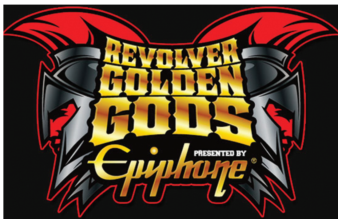
Logo for this year's hard rock award show from Revolver Magazine "The Golden Gods"