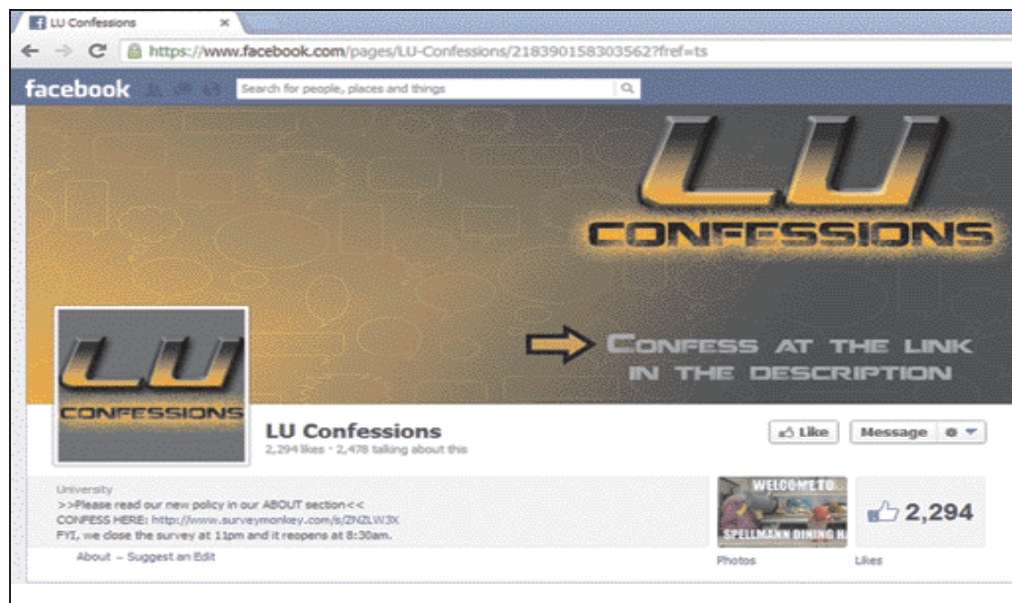
This screen capture shows the top portion of the LU confessions Facebook page. As indicated in the lower right hand corner, the page has 2,294 'Likes' as of April 29, 2013.

Despite some criticism, page adjusts to remain popular