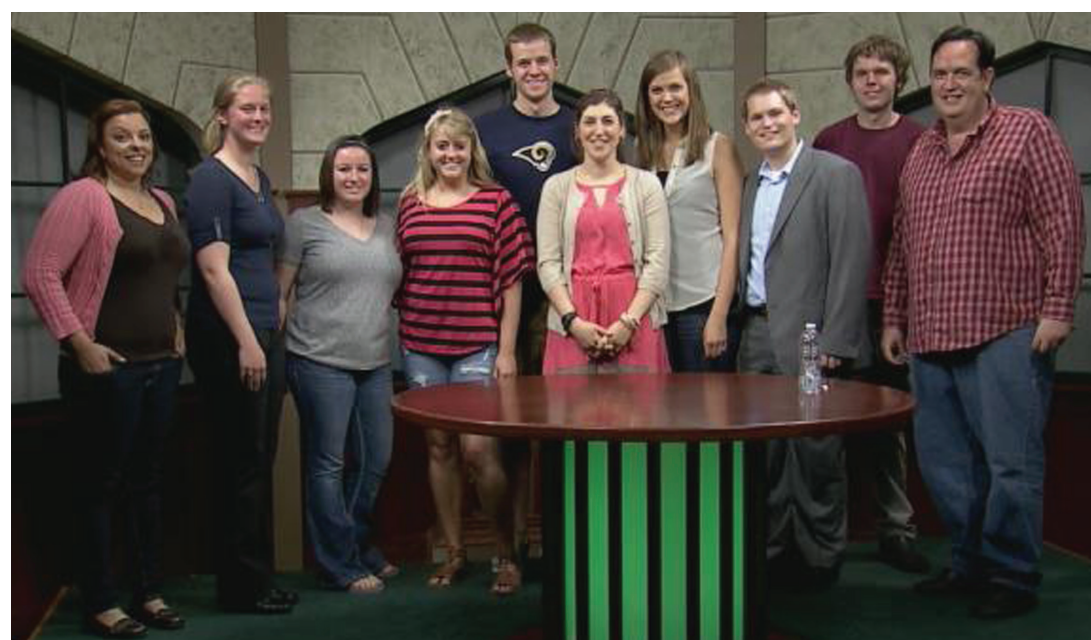
A group of LU students gather around Mayim Bialik for a photo opportunity in the LUTV studio. Bialik spoke in front of more than 1,000 people in the Hyland Arena on April 25, 2013.