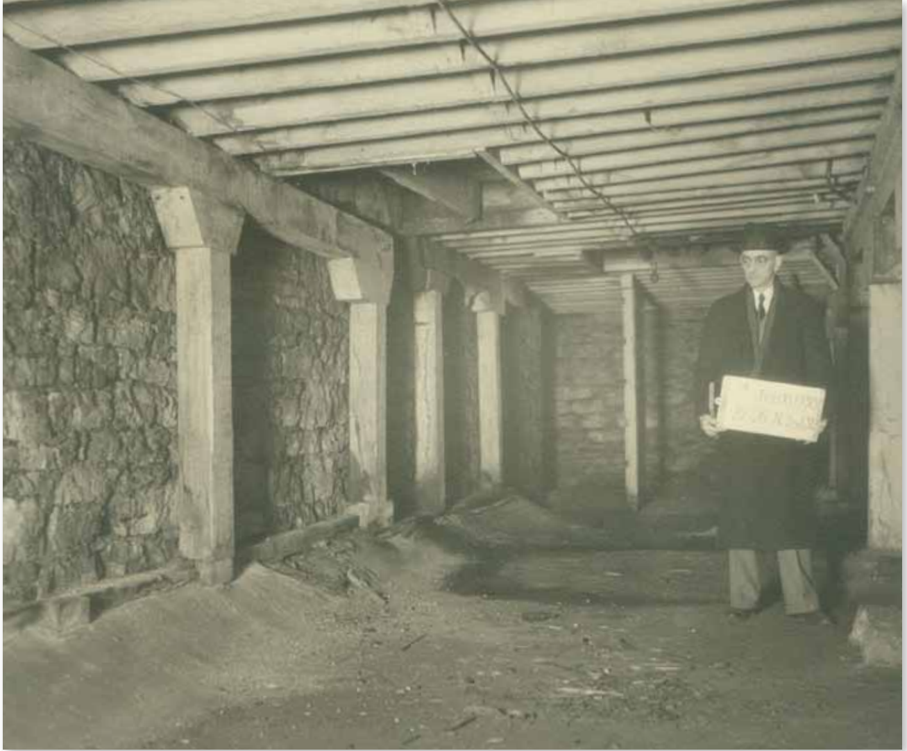
The basement at 22-26 North Second Street. Before structural steel, a three-story building required a wide stone foundation and massive wooden beams.

postage has subsidized low rates for newspapers and magazines. Publishers did not prepay their postage until 1875. Although the rates were cheaper if a subscriber prepaid their postage one quarter in advance at their local post office, many newspapers still arrived with postage to be collected. Publishers mailed copies to former subscribers as well as large numbers of sample copies in hopes that someone would pay the postage and read their publications. As a result, every post office in America was burdened with mounds of unclaimed newspapers, which the post office had already transported without receiving postage.