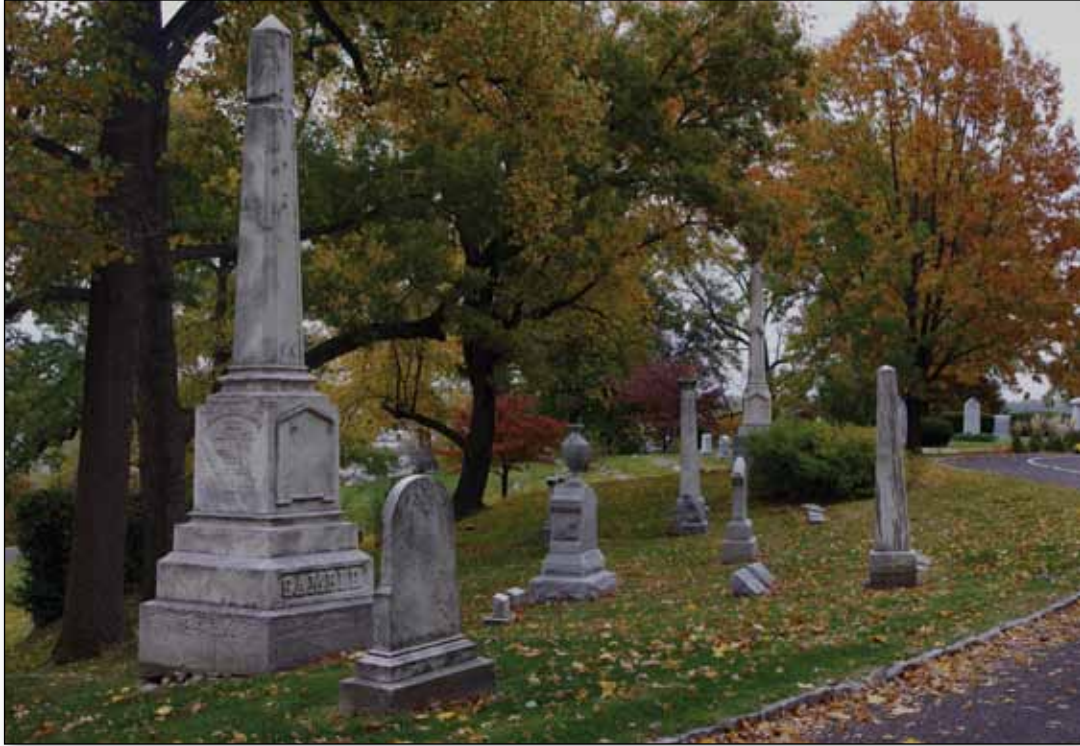
The Gamble family burial lot was among the earliest purchased at the rural cemetery in St. Louis, Bellefontaine.

began searching for an immediate solution to the needs of the St. Louis Post Office.