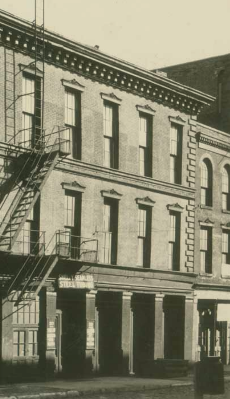
The Post Office occupied the ground floor of this modest Italianate building at 22 North Second Street from 1852 until 1859. The C. A. Roberts Company, which stored steel tubing on the ground floor, was the last tenant. Eugene Taylor took this photograph in 1936. (Photo: National Park Service, Jefferson National Expansion Memorial Archives, Record Unit 106.8-5 Parcel Files)

By 1851, Postmaster Archibald Gamble realized that St. Louis needed a larger post office sooner than Congress would act to provide one. The cramped quarters he rented at 87 Chesnut were no longer adequate for either the city's rapidly growing population or the surging mail volume encouraged by cheap postage. From 16,469 inhabitants in 1840, the population of St. Louis had exploded to 77,860 by 1850. It would more than double again, reaching 160,773 in 1860. St. Louis was the eighth-largest city in the nation, closely trailing Cincinnati and New Orleans. Nationally, the U.S. Post Office delivered slightly fewer than 40 million letters in 1845, the first year of reduced postage rates. By 1854, that volume had swollen to nearly 120 million letters. Exceeding mere population growth, the average number of letters received per capita more than tripled from 1.61 in 1840 to 5.15 in 1860. Having the support of local investors, Gamble wrote to Third Assistant Postmaster General John Marron in October 1851: