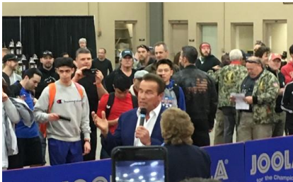
Table Tennis Finds Success at Arnold Challenge

Men's rugby held off a vastly improved Arkansas State squad 36-32 in a Mid-South Conference match. With the victory, Lindenwood improved to 12-1 in collegiate play overall and 4-1 in the Mid-South.