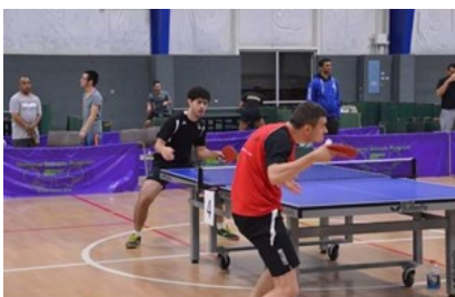
Table Tennis Earns Seven Top Three Finishes

Men's bowling captured the title while the ladies fell in the semifinals at the 9th Annual Hammer Lion's Classic October 28-29 at St. Charles Lanes and Plaza Lanes in St. Charles, MO.