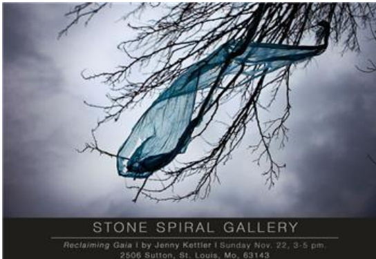
Photo Exhibition Reclaiming Gaia Opens Sunday in St. Louis