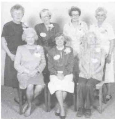
Our "golden girls" from the Class of 1939 celebrated their 50th anniversary!