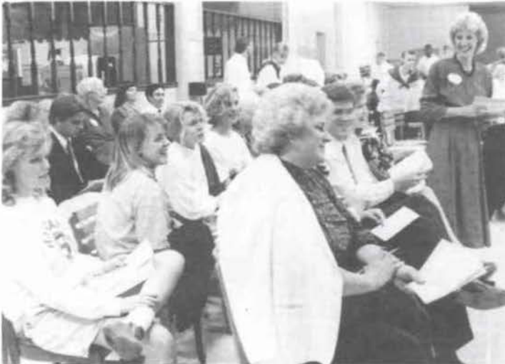
Friday night's Benefit Dinner/Auction got the Weekend off with a bang. Students and alums raised about $9,500 for the Lindenwood/Soviet Exchange Program. The evening's menu consisted of borscht, caviar, red cabbage and beef tenderloin. (It was actually good.)

Since pictures tell more than words, we have assembled this scrapbook for you to enjoy. . .