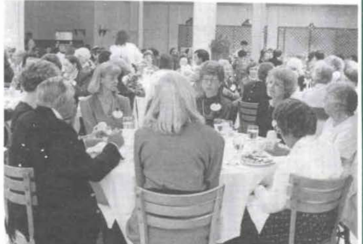
About 125 alumni, faculty and staff attended the Alumni Association's Annual Meeting and Luncheon.