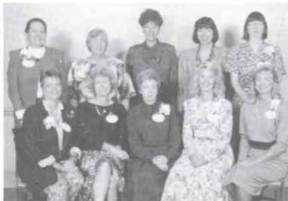
Congratulations Class of 1964 on your silver anniversary!