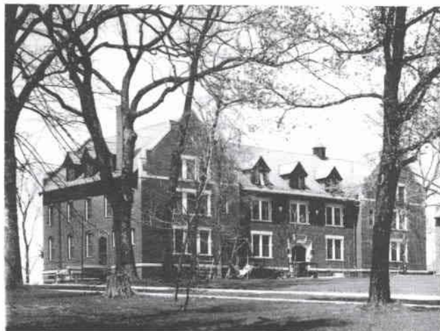
Ayres Hall, 1920s

ALUMNI REUNION 1991 WILL BE A TIME WHEN ALUMS CAN REVISIT A CAMPUS THAT IS ONCE AGAIN COMPLETE. A dormitory is a place where dreams are made, friendships are created that last a lifetime, and where teenagers grow into adults. Revisit Ayres Hall and recapture those feelings of youth, excitement and friendship. Visit the room you shared with your best college friend, where you shared secrets, or perhaps played bridge in the parlor until 1 a.m. The memories are here to share, and we ask those of you who made them happen to be a part of Reunion 1991.