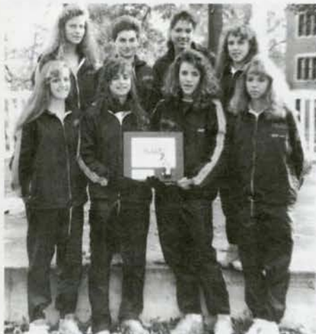
Members of the Lindenwood Lady Lions Cross Country team.