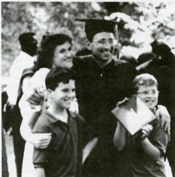
Happy graduate and family.

Please indicate approximate time we can expect to receive materials. _____