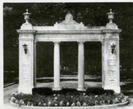
Lindenwood Campus renewed.

In addition to the funds spent to support the physical plant, the endowment has been revitalized, too. Gifts totalling over four million dollars have been made to this fund. The primary donor, who does not seek recognition, has made an irrevocable gift via an annuity to help secure Lindenwood's future.