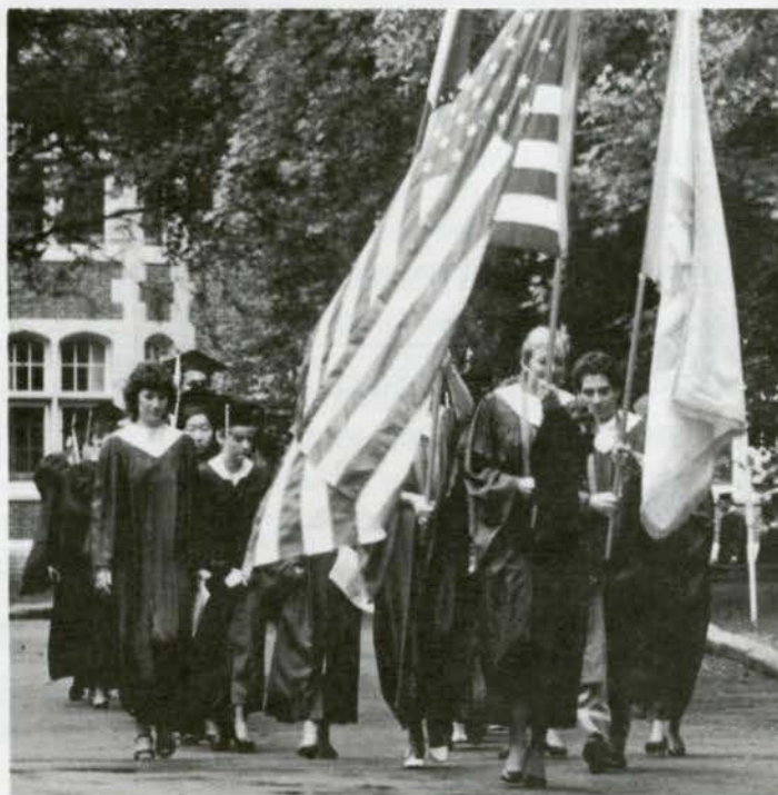
Linden Scroll members lead Commencement Procession.