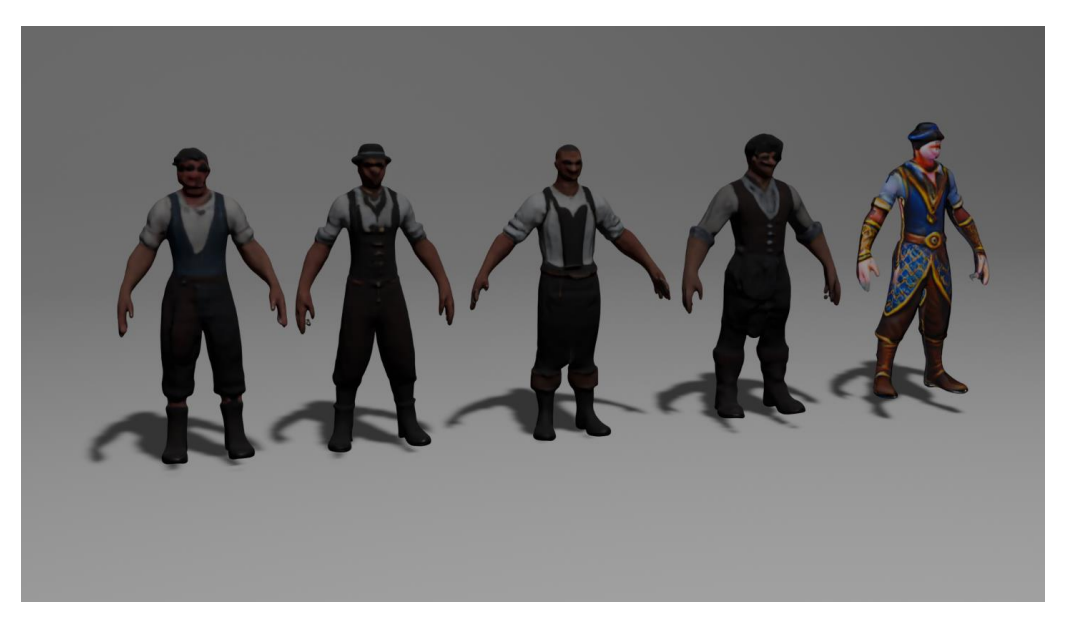
Figure 5. Textured and wireframe models of a tavern worker made in Luma AI.

As the project advanced into days five through seven, the focus shifted towards transforming the generated 2D concept art into 3D models. Employing Luma AI for text-to-3D generation and Alpha 3D for image-to-3D conversions, the process sought to assess these tools' efficacy in creating usable game assets. However, the venture into 3D model generation revealed critical limitations. The models generated from "A fantasy tavern worker, male, mid 20's" prompt presented grotesque and overly complex geometries, rendering them impractical for game development without significant modifications ( Figures 5 and 6 ).