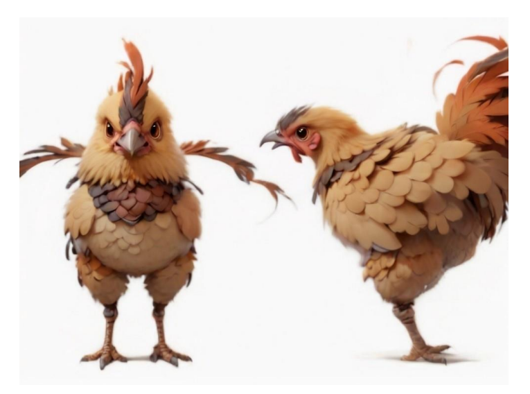
Figure 4. Second attempt at third prompt concepts generated in Leonardo AI about a chicken creature.