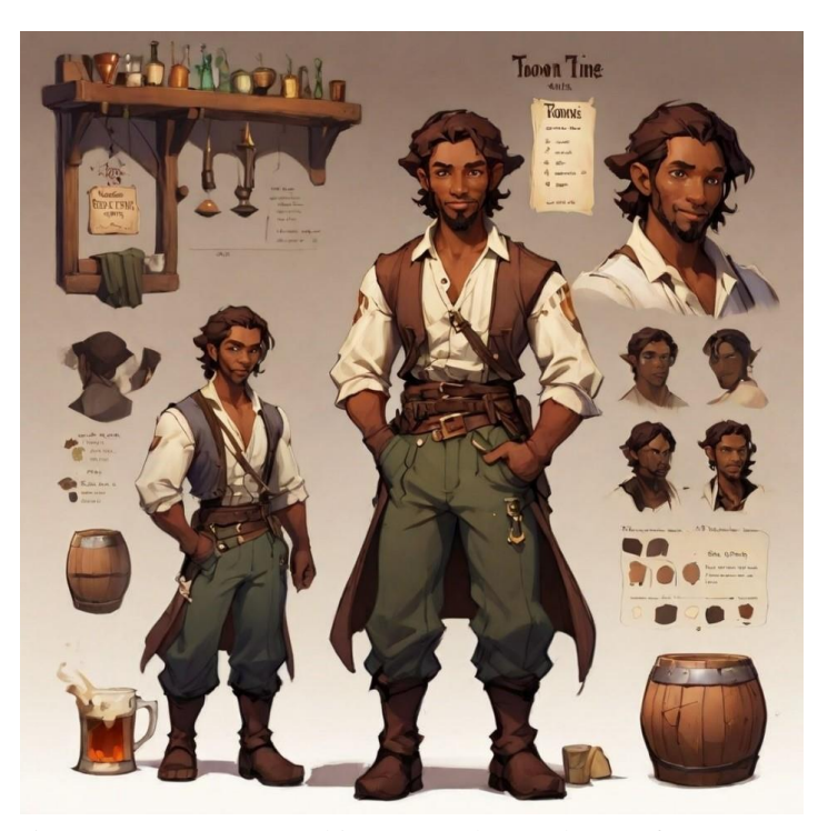
Figure 1. First concepts generated in Leonardo AI about a fantasy tavern worker.