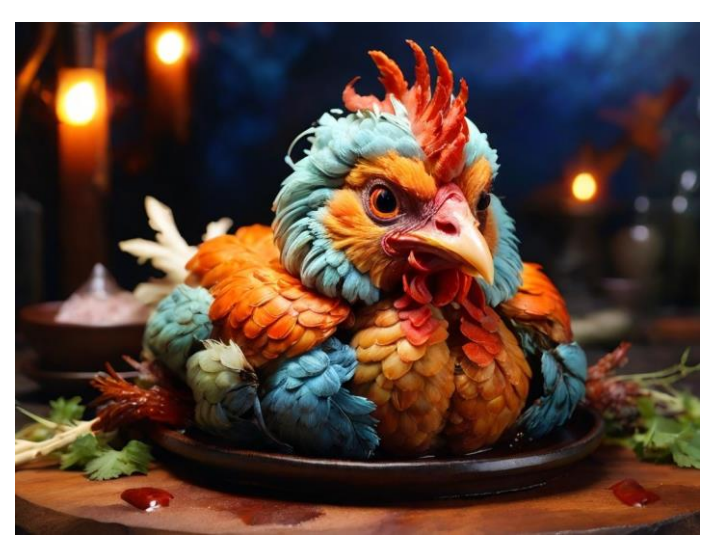
Figure 3. First concepts generated in Leonardo AI about a chicken creature.

The exploration continued with the creation of a creature concept. The chosen subject, a "fantasy wild chicken", was expected to enrich the game's fantastical ecosystem. Starting with prompts aiming for a cooked meat coloring and crispy textured feathers, the generated images initially skewed towards realism. Adjusting the prompts to include game-related descriptors and changing color schemes eventually steered the outputs closer to the desired fantasy styling ( Figures 3 and 4 ). The endeavor into creature design highlighted the AI's responsiveness to descriptive language, albeit the need for precise adjustments to align with creative vision.