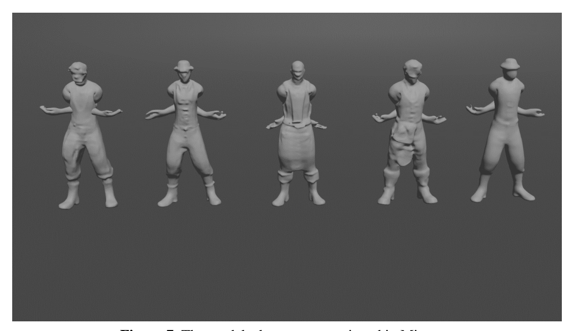
Figure 7. The models that were auto rigged in Mixamo.

The final phase involved importing the models into Unreal Engine 5, aiming to leverage the engine's Nanite system for optimizing the models' large polygon counts. Despite the promise of automatic rigging solutions like Mixamo, technical hurdles persisted. The armature integration and animation testing highlighted fundamental flaws in the models' structure and compatibility with game engine requirements, culminating in significant deformation issues ( Figure 7 ).