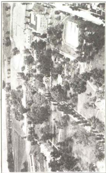
AEROPLANE VIEW OF CAMPUS