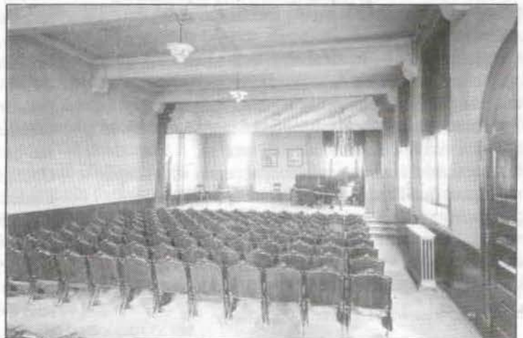
The chapel/assembly hall in Sibley Hall, as it appeared in 1907.