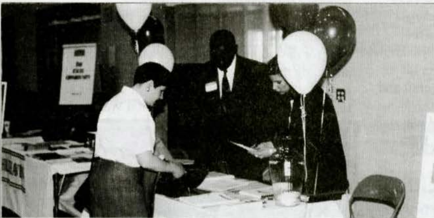
A Lindenwood student exchanges information with representatives from a temporary agency at the College's 2nd Annual Career Fair.

Nearly 200 students and more than 50 employers networked, interviewed and exchanged information at Lindenwood's 2nd Annual Career Fair, held March 20 in Butler Gymnasium.