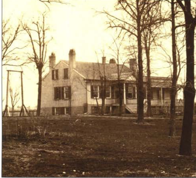
The Eliots' "Beaumont Home" in St. Louis, c. 1855.