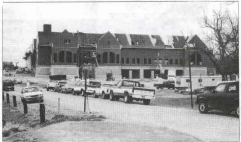
The Lindenwood College Performance Arena is taking shape on the back part of the campus. It is scheduled to open in the fall.

You can still play a key role in the Performance Arena and be counted among the special group of contributors who have made this project a reality. A limited number of luxury seats are still available to be named in honor and recognition of special donors, or you can give a pledge to be made over as long as five years. Please contact the Development Office to let us know you want to be a part of Lindenwood's exciting future. Call (314) 949-4903 for more information.