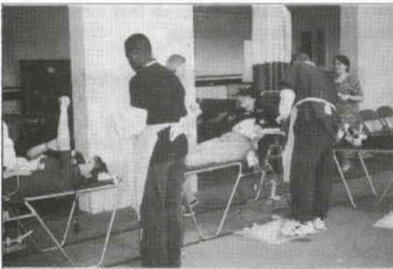
Lindenwood students, faculty and staff joined together to give blood in Butler Gym.