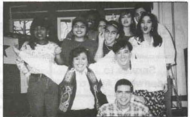
Panama students pose for Panama Night in Ayres Dining Hall.