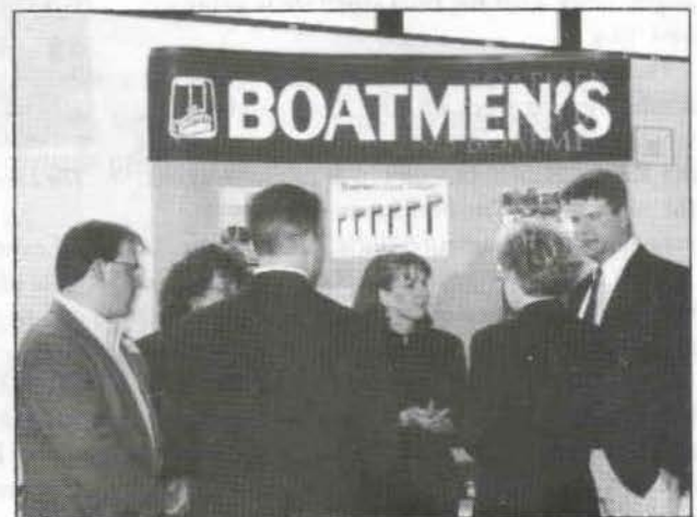
Lindenwood students talking to representatives from Boatman's Bank during the third annual Career Day.

A record number of student athletes were also named to the fall Athletic Academic Honor Roll. The list consisted of 151 students who had a 3.0 or better. Thirty-five students had a 3.75 grade point average or better, which included 13 perfect 4.0s.