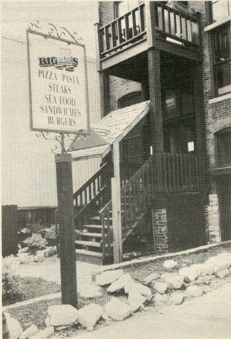
ON THE RIVERFRONT: Big A's is located at 308 N. Main in St. Charles.