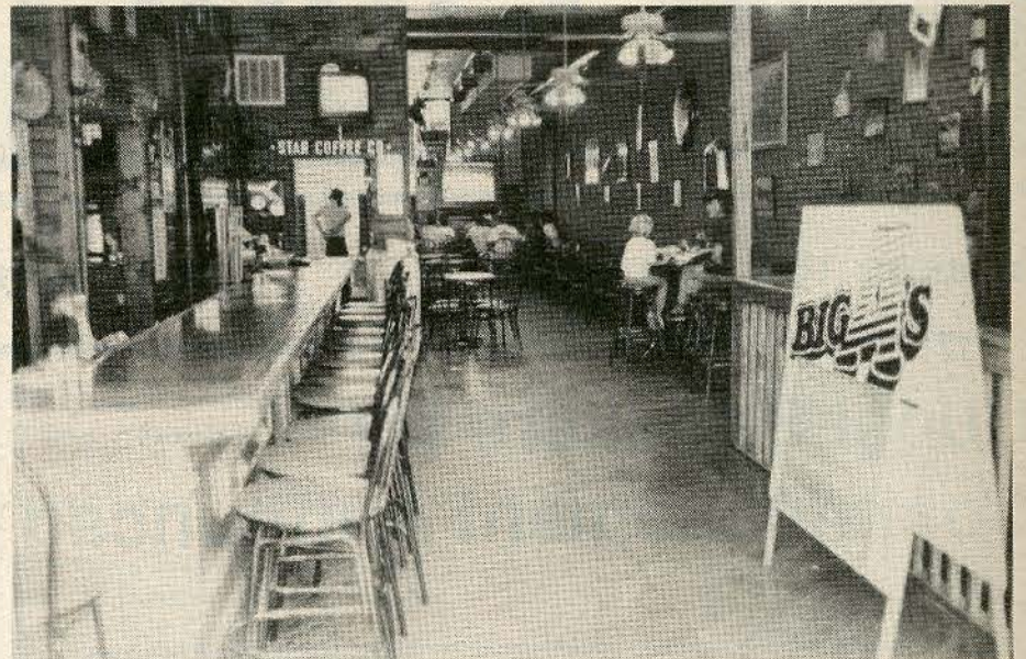
OUT TO LUNCH: Big A's on the Riverfront is a place where a lot of the business people on Main Street go for lunch.

the decor is mostly antiques and sports memorabilia.