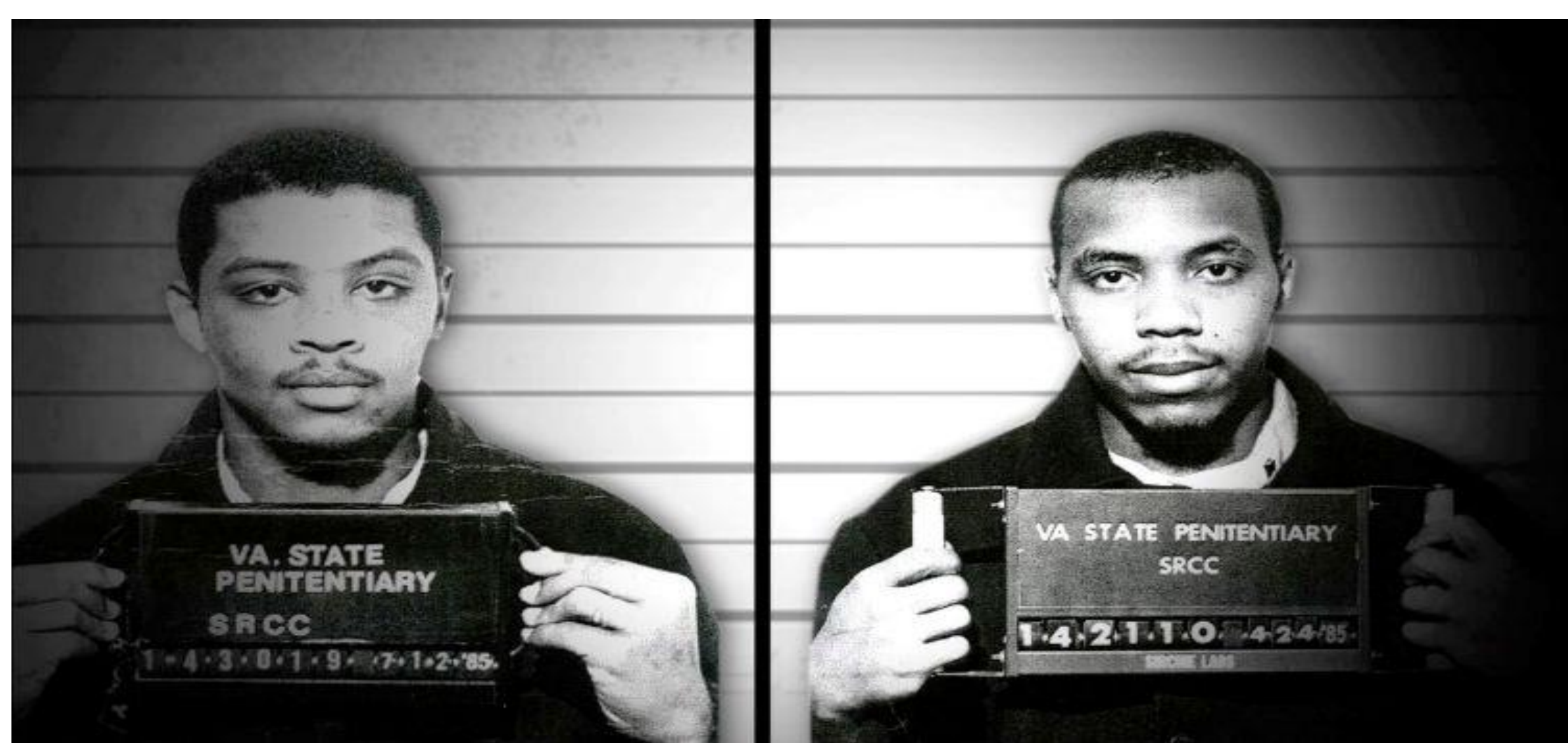
What to expect from "The innocence files," Netflix's New Documentary Series inspired by the innocence project. Innocence Project. (2020, June 16). Retrieved April 5, 2023, from https://innocenceproject.org/netflix-innocence-files-documentary-series-bite-marks-wrongful-conviction/#:~:text=%E2%80%9CThe%20Innocence%20Files%E2%80%9D%20dives%20deep%20into%20three%20major,the%20misuse%20of%20eyewitness%20identification%3B%20and%20prosecutorial%20misconduct.

Eyewitness identification reform. Innocence Project. (2020, December 17). Retrieved April 5, 2023, from https://innocenceproject.org/eyewitness-identification-reform/