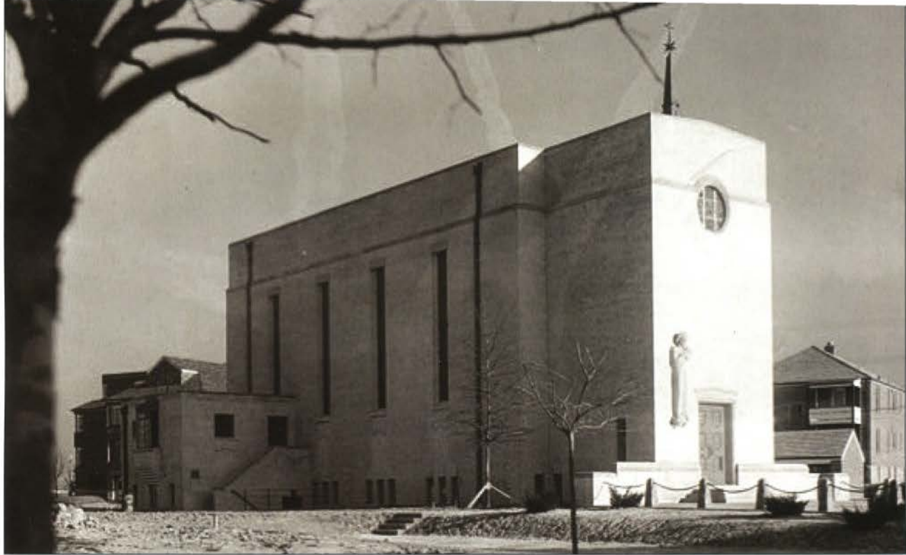
The new St. Mark's Episcopal Church was considered architecturally significant even when it was newly built in 1939. It was included in the Historic American Buildings Survey, which was usually reserved for documenting historical architecture rather than new buildings.