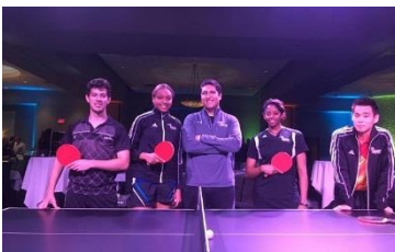
Table Tennis Players Involved in Community

Our student athletes have been busy serving the community. Recently, the Student-Athlete Advisory Committee raised funds for Make-A-Wish and hosted two children as guests of honor for the evening. The football and women's hockey team volunteered at Family Reading Night at the Harvest Ridge Elementary School and the women's lacrosse program ran a lacrosse clinic in Miami during a trip to Florida. In addition, members of the wrestling team volunteered their time at the Boys and Girls Club in St. Charles, MO, and the field hockey team assisted with the FISH program.