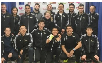
Table Tennis Posts Seven Top-Four Finishes