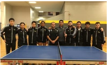
Table Tennis Qualifies for National Championship

The men's ice hockey team outlasted Ohio 3-2 in the second overtime period at the Edge Ice Arena in Bensenville, IL.