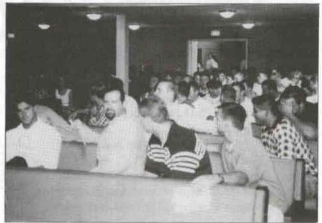
Students fill the Lindenwood College Cultural and Community Center for the Academic Convocation, the first official function in the auditorium.

Thanks to the three organs Lindenwood now owns, a new academic program is being considered. The Sacred Music Institute would prepare students to become music directors for churches. Choral, organ and piano instruction would be offered. When implemented, students can receive an undergraduate degree or complete a certification program in Sacred Music Instruction.