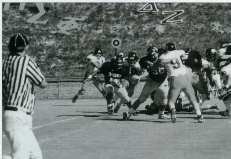
Lindenwood's seasoned backfield has been a driving force for the Lions this year.