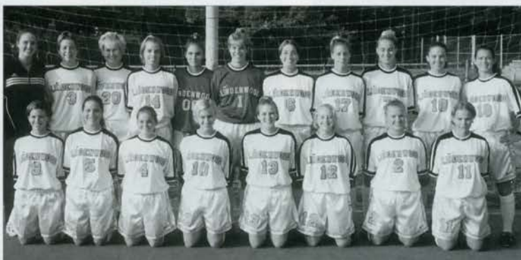
(Above) Members of the 1998 Lindenwood Lions women's soccer team.