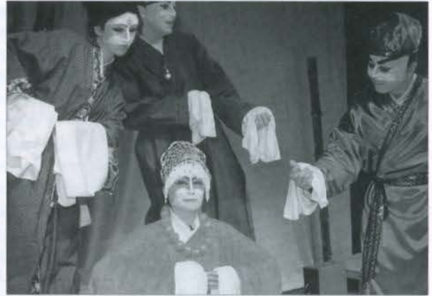
A scene from the world premiere of "The Wedding Bandit," based on a traditional Chinese story.