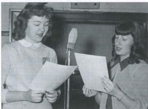
Two Lindenwood students broadcast from the main studio.

After 50 years, it seems strange to think Lindenwood University's communications division, which has yielded a host of communications luminaries, started with the purchase of five cash registers.