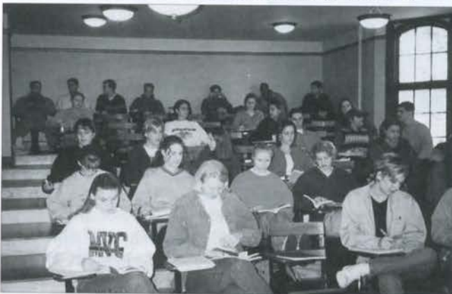
Historic Room 209 in Roemer Hall.

Also in progress is an "enhanced classroom" project that entails the renovation of four classrooms in Young Hall and the addition of a mobile unit that will serve five second-floor classrooms in the LU Cultural Center. The upgrades will make for a increased presentation capabilities with "smart boards," computer projection units and visual presenters (which allow an instructor to project the image of a three dimensional object onto a screen). A second phase of the "enhanced classroom" project, to be completed next year, would include two classrooms in Roemer Hall. ✱