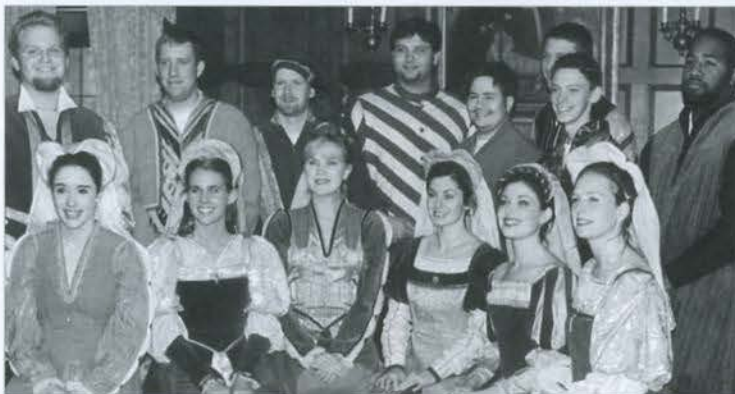
Members of the performing troupe for the 1998 Madrigal Dinners.

Dance Alive has been a popular entry with audiences who have been dazzled by the variety of choreographic styles. Several dances that originated with our critically acclaimed Dance Alive series have entered the repertoire of professional dance companies and have been performed at national galas. Dance Alive! Shows are April 22, 23 and 24 at 8 p.m. and April 25 at 2 p.m. in the Hyland Performance Arena.