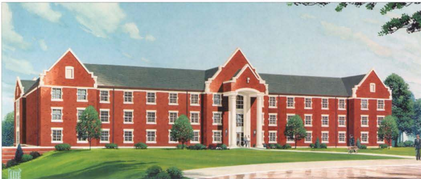
Architect's rendition of Lindenwood University's new residence halls.

New residence halls to feature classic design, modern amenities