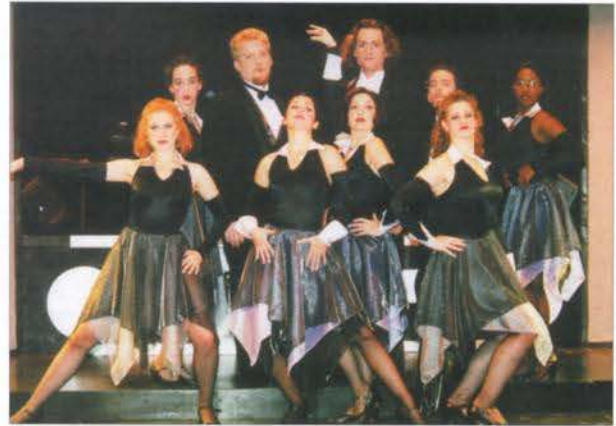
A number from the musical revue, "The World Goes 'Round: The Songs of Kander and Ebb," from the 1998-99 season.

This universal classic from the Greek period explores the responsibilities of individual beliefs vs. political authority. This play is as current for 2000 A.D. as it was for the 5th century B.C.