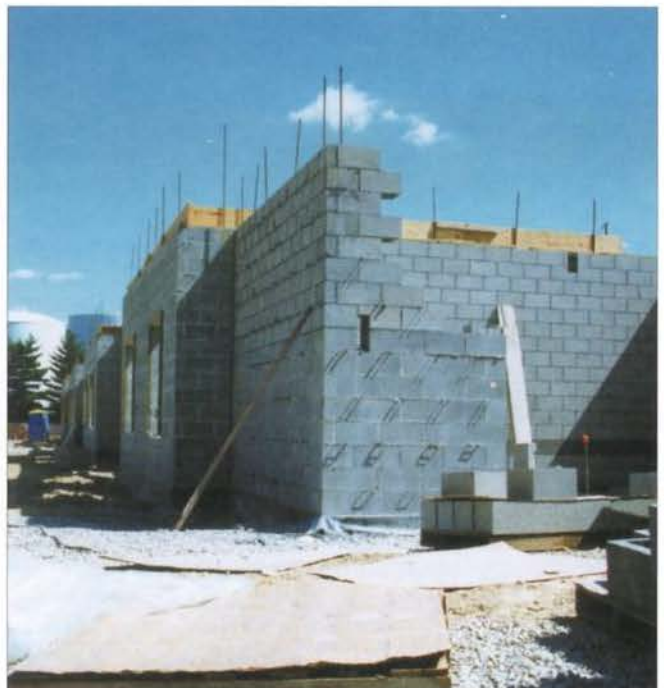
One of the two new residence halls in progress.

L.U. remains Missouri's fastest-growing college or university, with enrollment expected to surge past 10,000 during the 1999-2000 academic year.