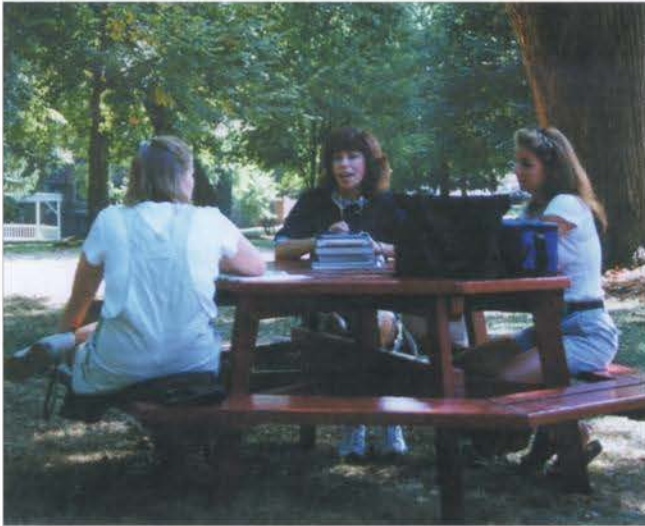
Beautiful weather and scenic surroundings make the LU campus quadrangle a popular gathering spot between classes during the first weeks of the fall semester.