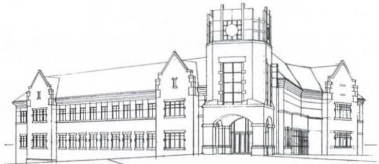
View from Southeast Hastings/Chivetta

100,000-square foot building on hillside will overlook stadium