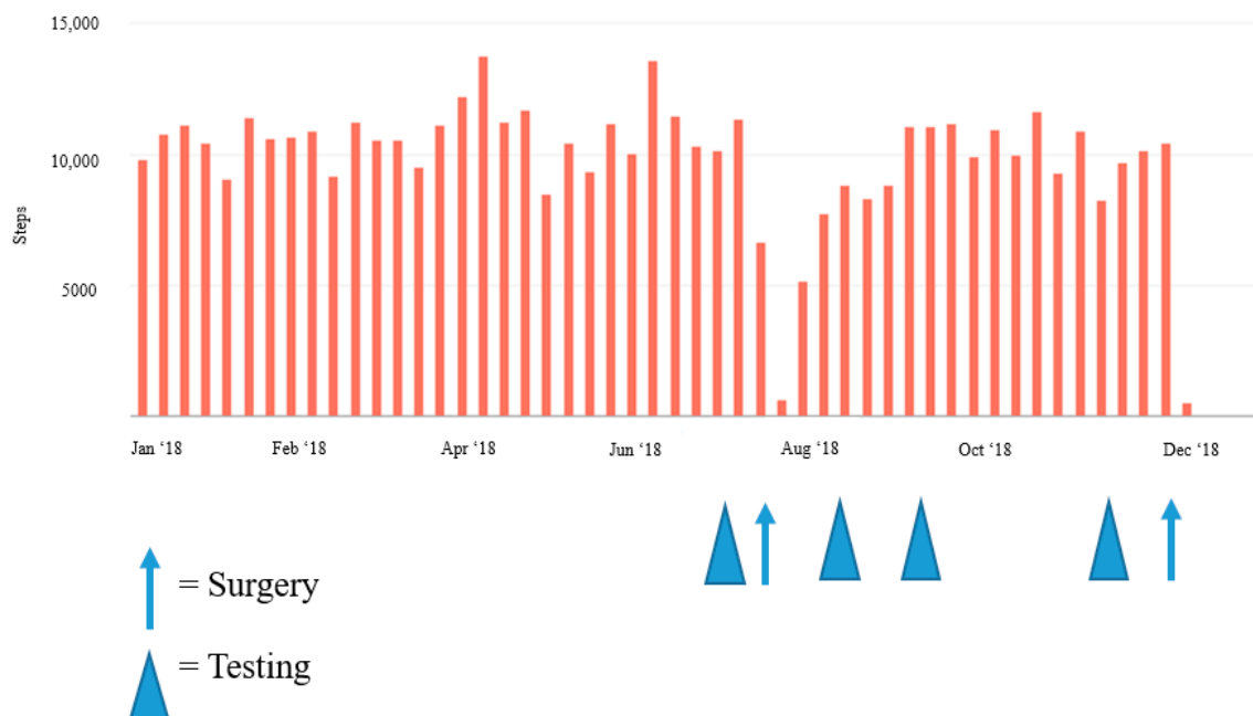
Figure 2. Weekly changes in step activity during 2018, pre- and post-operation.