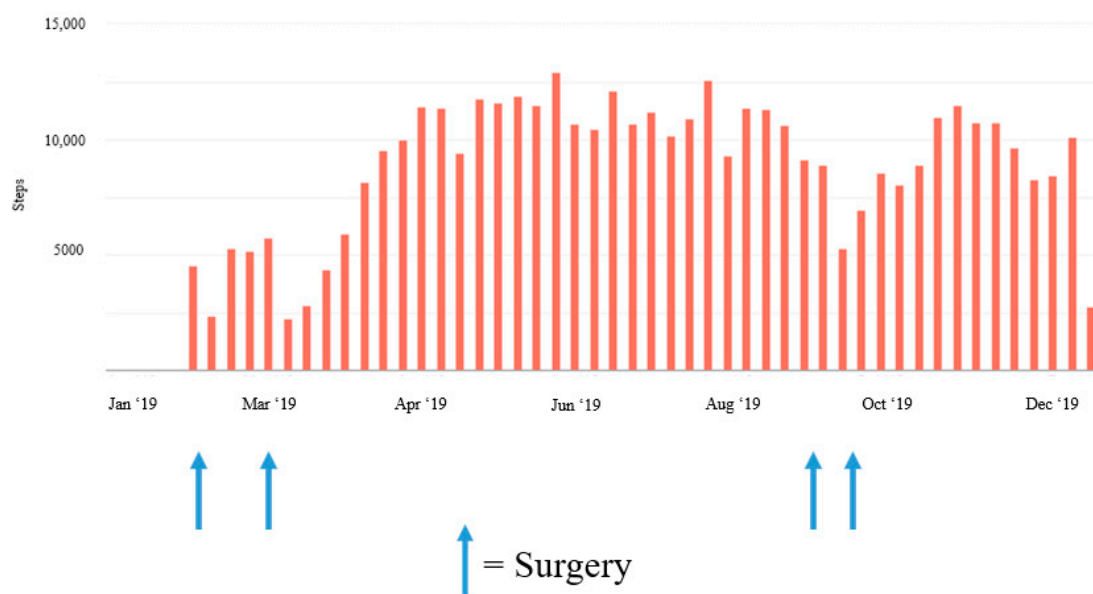
Figure 3. Weekly changes in step activity during 2019 pre- and post-operation.