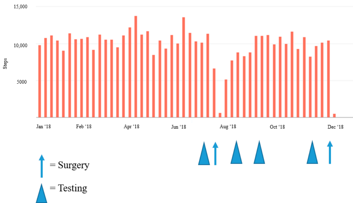
Figure 2. Weekly changes in step activity during 2018, pre- and post-operation.