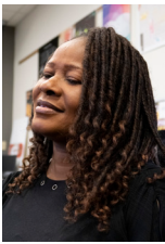
Happiness Anue LB Glamour Collection