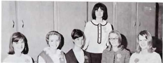
Present at the meeting to hear about the college and to meet others who will be at Lindenwood for the first time were these high school seniors.