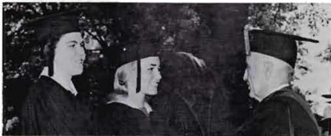
TWO AWARDED FELLOWSHIPS