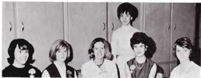
A group of high school seniors from the Kansas City area who will be enrolling as freshmen at Lindenwood next fall.