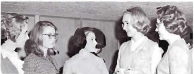
Girls presently enrolled at Lindenwood and high school seniors planning to attend the college are shown talking.