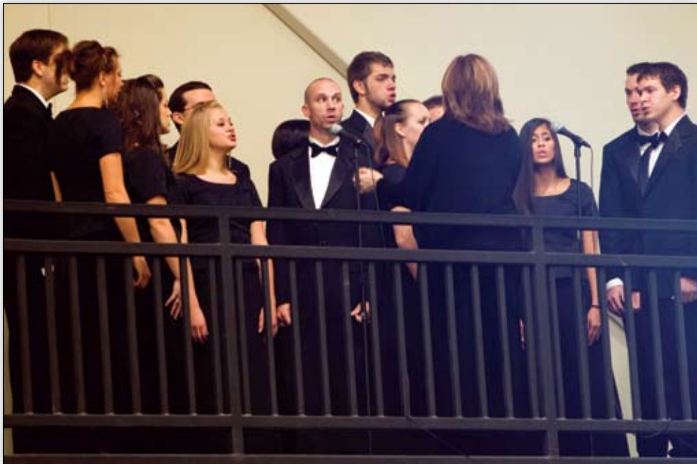
Voices Only sings the alma mater for the first time at Lindenwood's presidential investiture ceremony in November 2007.

Near the banks of the Missouri Upon a hillside green, Where the linden trees sway gently, Our Lindenwood is seen.