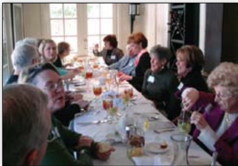
Alumni in Scottsdale enjoy reconnecting and sharing their favorite Lindenwood memories