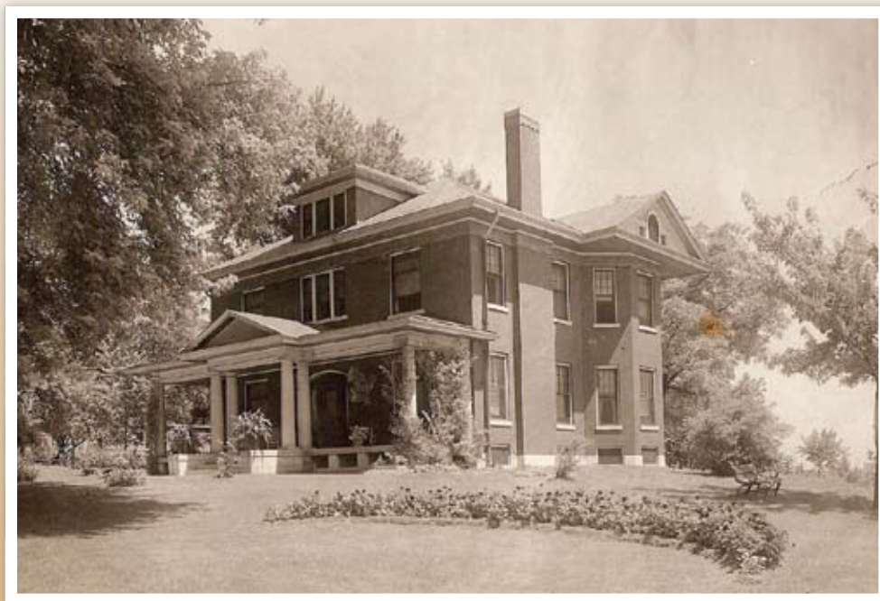
The Bruére House circa 1914. The home is currently Stumberg Hall, a women's residence that houses up to 20 students.