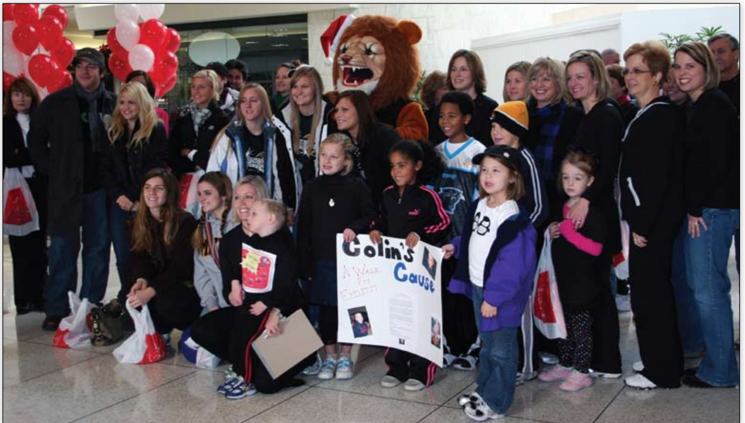
The Colin's Cause Team and Lindenwood cheerleader volunteers with Lindenwood Mascot Leo the Lion at the Holiday Walk

This is just one example of how Lindenwood students are actively supporting worthwhile causes in the community.