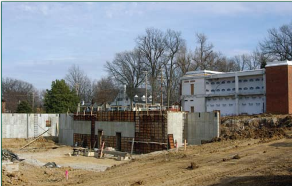
A major renovation to Harmon Hall is well under way.