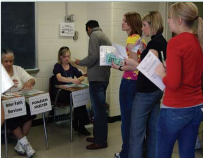
The Lindenwood School of Human Services sponsored poverty simulation exercises for students to participate in during Sibley Day.