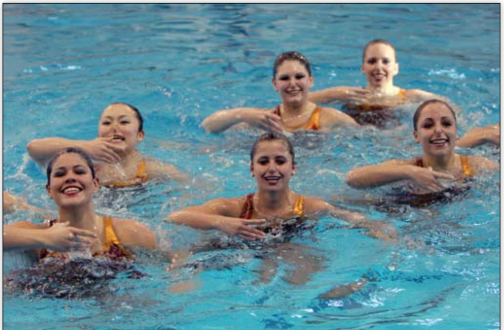
Synchronized swimming is a hit at Lindenwood University.