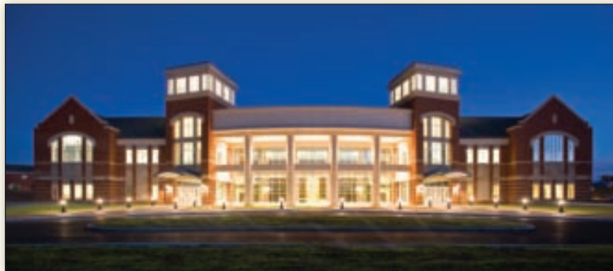
A nighttime look at the new Lindenwood Center.