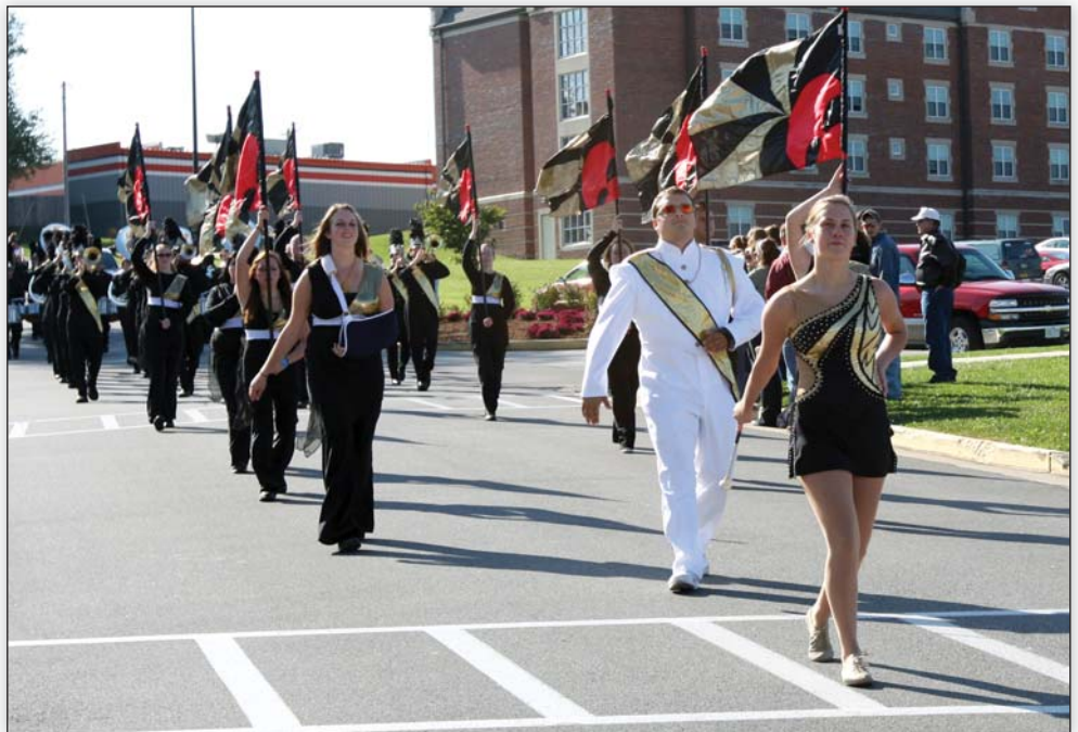
Lindenwood's marching band proudly makes its way down John Weber Drive during the Homecoming Parade.

"With the new J. Scheiddeger Center for the Arts as a resource, the sky's the limit."