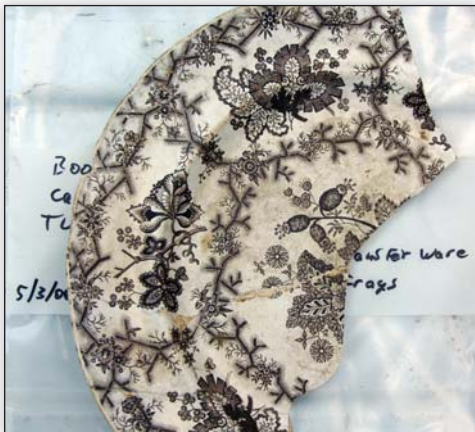
A broken plate was one of the treasures discovered during the dig. The students are researching the piece to learn more about its origins.

"I love it," he says. "It's amazing to unearth something that's been here all along, and people have walked right by it or over it without ever knowing."