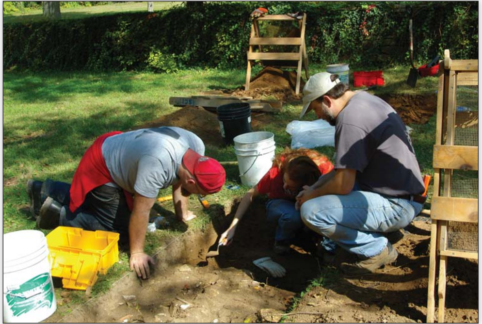
Students work alongside their professor in an archeology dig at the Historic Daniel Boone Home.