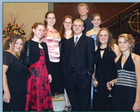
Lindenwood students gather before the opening night performance.