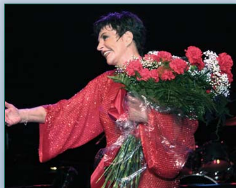
Liza Minnelli accepts a bouquet after her performance.