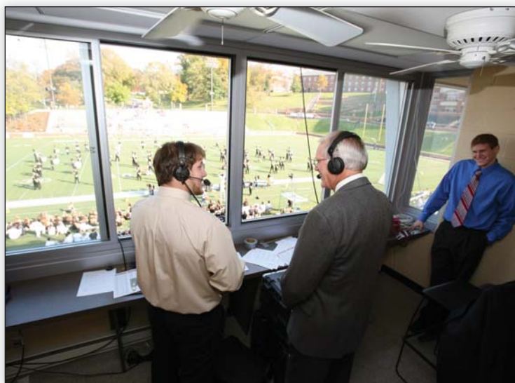
Hunter was interviewed on Lindenwood's radio station, KCLC, during halftime.