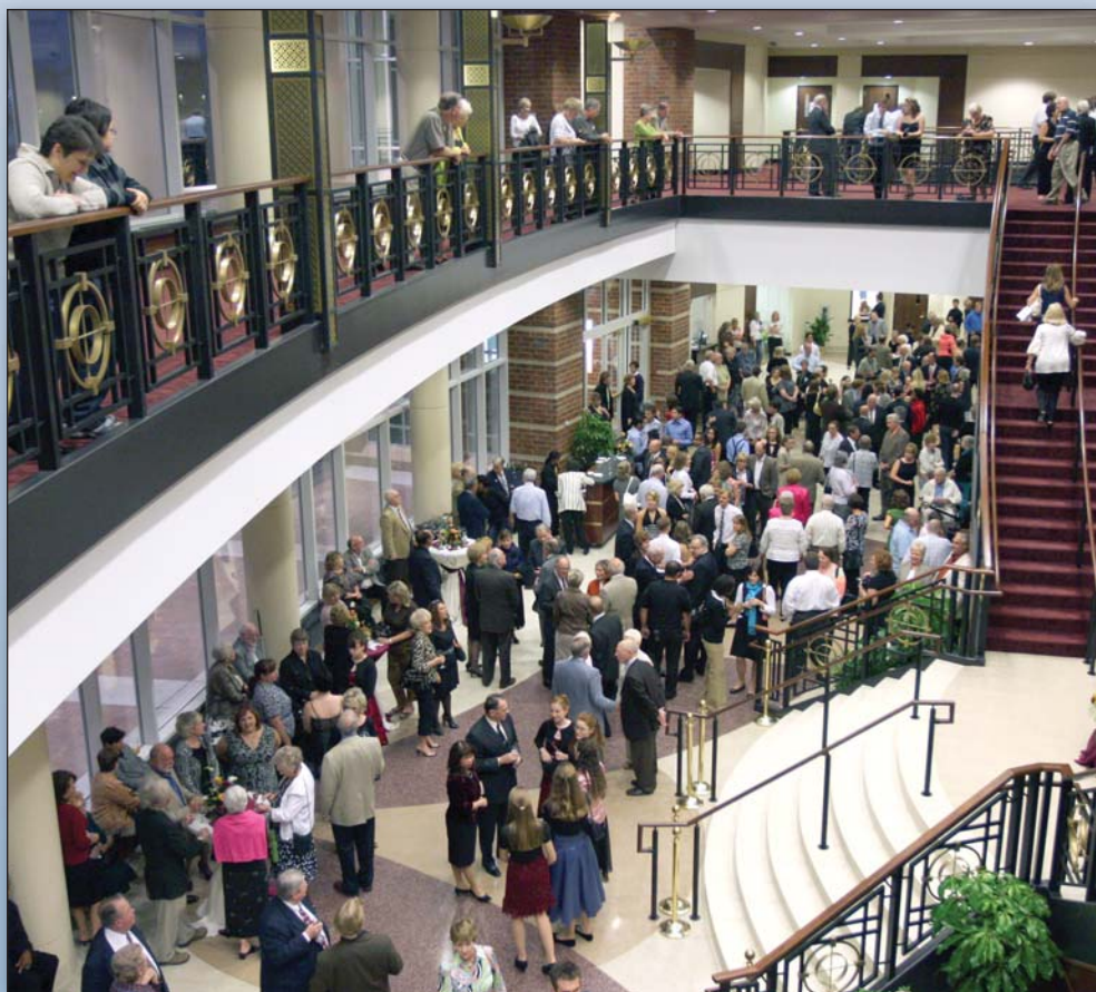
The lobby was packed for the gala event prior to Liza Minnelli's opening show at the J. Scheidegger Center.

For information on tickets to professional and student shows, please contact the Scheidegger Center Box Office at 636-949-4433 or go to www.lindenwoodcenter.com .