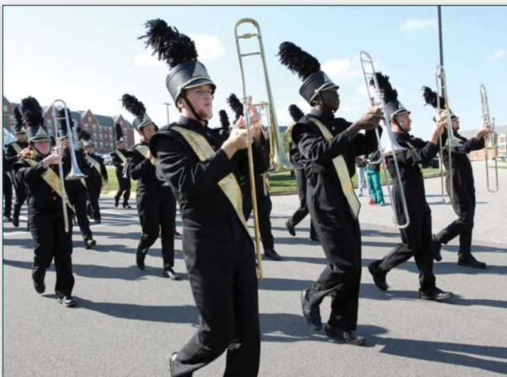
The trombone section marches in synch.