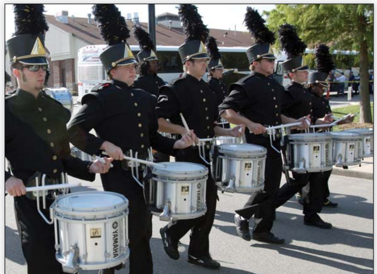
The drum section marches down John Weber Drive.