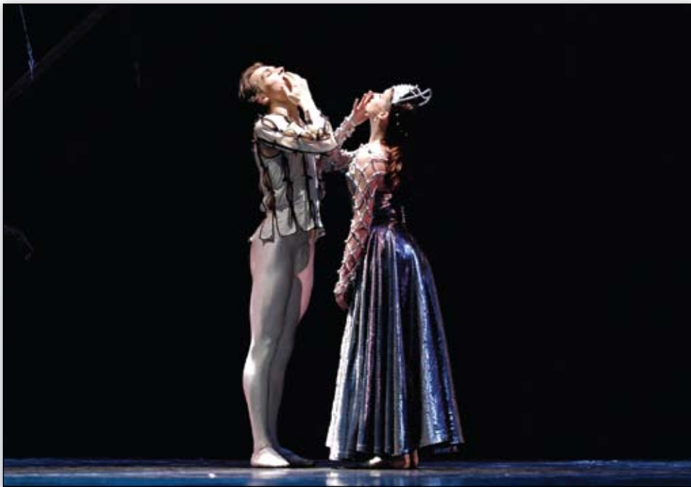
The Russian National Ballet Theatre will perform Tchaikovsky's Romeo and Juliet at the J. Scheidegger Center for the Arts on Jan. 21