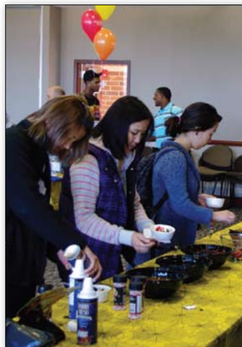
LU students in line at the recent ice cream social.