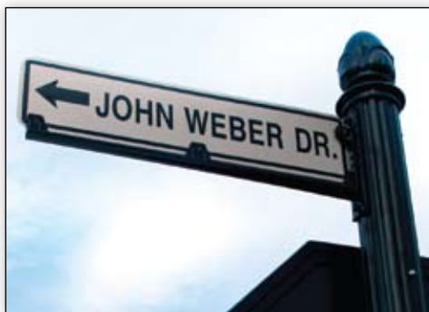
John Weber Drive is one of only two campus streets that are named.

The names of campus streets invariably say a lot about the history of the institution. At Washington University in St. Louis, Mo., one name in evidence is that of