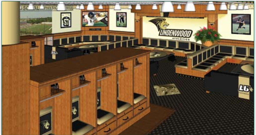
Artist's rendering of the football locker room in the new athletic building.