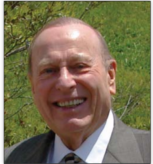
Renderings of the recreation room and library of the new Alan J. Dixon Student Center; (above) Alan J. Dixon

Lindenwood has invested more than $10 million in the Belleville campus since acquiring it in 2003, including the construction of a new Welcome Center and extensive renovations to the auditorium, communications building, "L" building, and the exterior of the future student center.