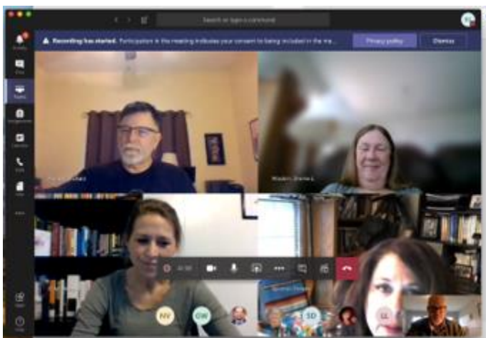
Faculty meet online for the weekly Educational Leadership Council.

Faculty and staff are staying connected with each other and students while working from home this semester. Meetings have been transferred to Zoom and University offices have been moved to home spaces. Further, in seat classes are now completely online. Thanks to all staff, faculty, and students for their hard work and patience. Please, stay safe and healthy!