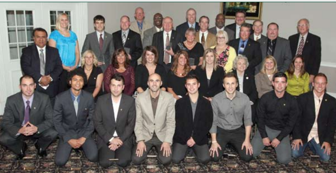
The 2010 Hall of Fame class photo.