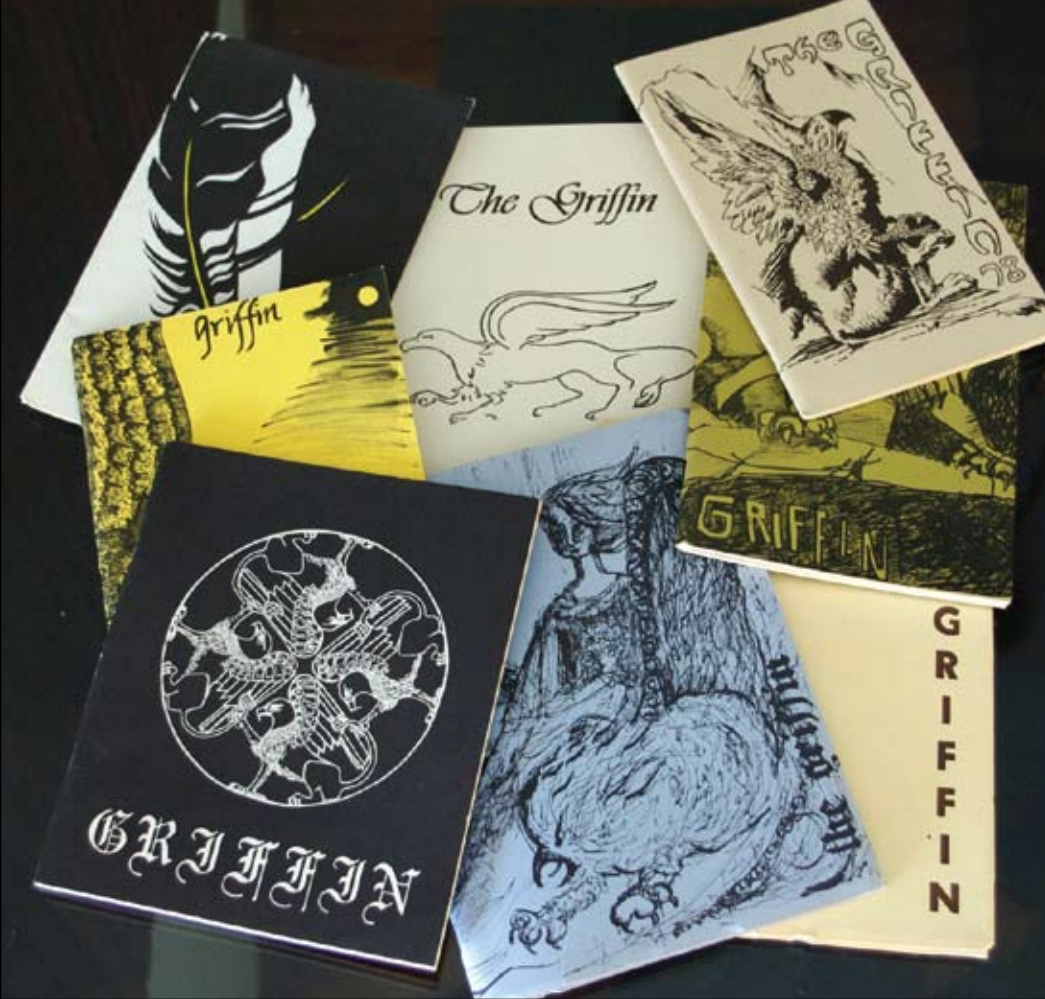
Recently found copies of The Griffin literary magazine, which was published from 1949 to 1998.