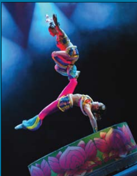
The National Acrobats of the People's Republic of China will appear at the J. Scheidegger Center for the Arts on Oct. 15.

For a complete list of professional and student shows for the 2011-2012 season, visit www.lindenwood.edu/center .