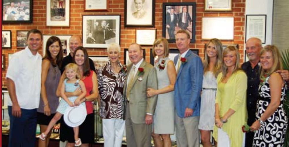
Top left: Former U.S. Senator Alan Dixon speaks at the recent opening of the Alan J. Dixon Student Center at the LU-Belleville campus. Top right: Dixon poses with his family in front of the student center's display of memorabilia from his time in public service.