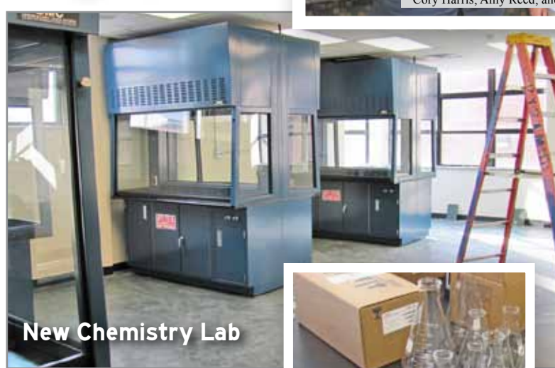
New Chemistry Lab