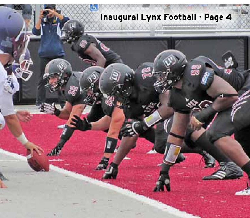
Inaugural Lynx Football · Page 4