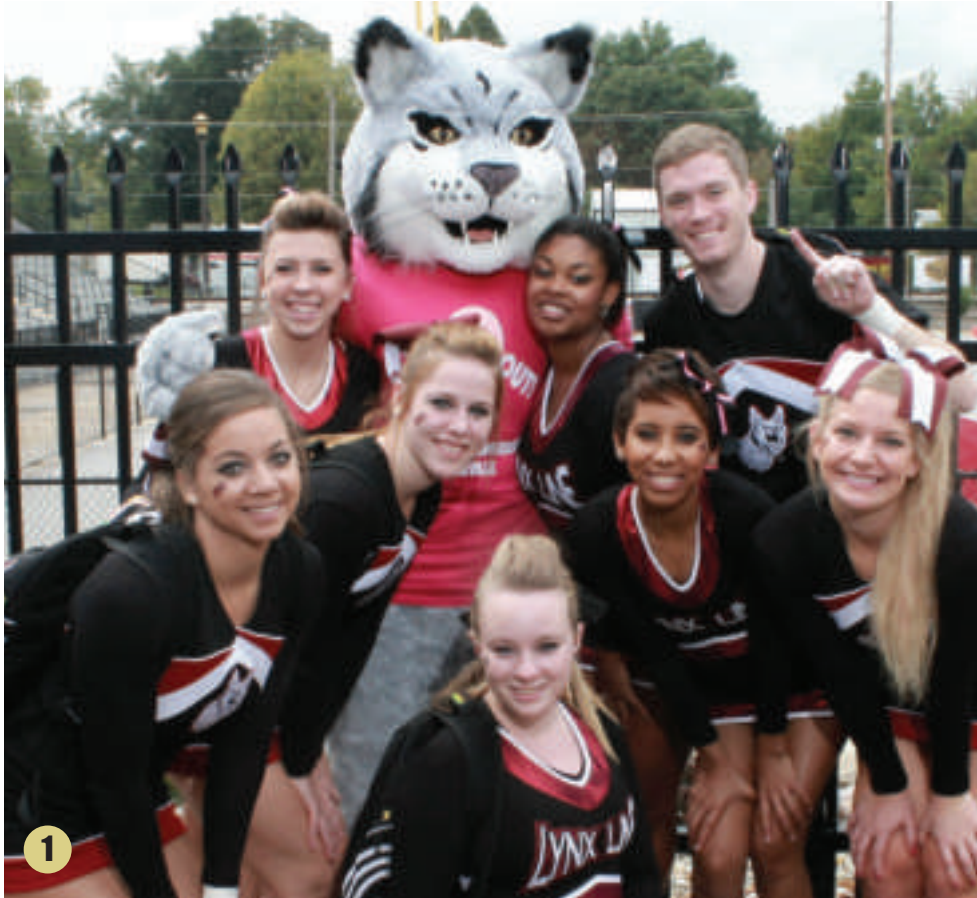
1. Lindenwood Belleville cheerleaders and the Lynx mascot get ready for the game.

On Saturday, Oct. 5, Lynx Stadium was packed with fans to watch Lindenwood Belleville face off with Menlo College in the Homecoming football game. Parents and families came early to tailgate before the game and enjoy the Parents Weekend activities. In honor of Breast Cancer