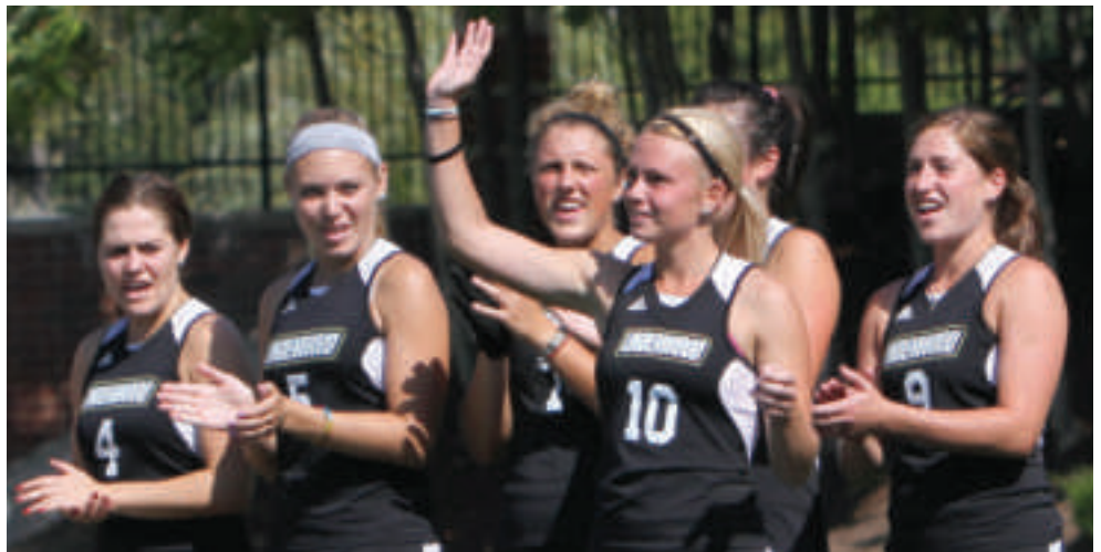
The 2013 field hockey team finished with a five-game winning streak.

The Lady Lions soccer team was picked near the bottom of the preseason conference standings but became one of the surprise teams in the MIAA. Lindenwood sat on top of the MIAA for much of the season before eventually finishing sixth with a 5-5-1 conference mark.