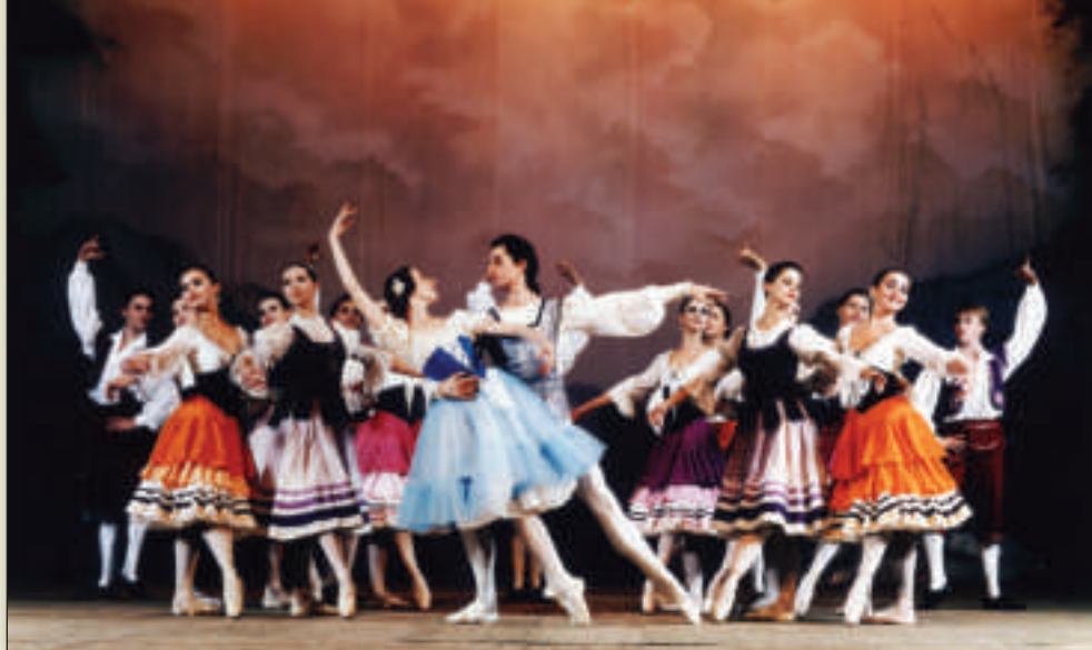
The Moscow Festival Ballet