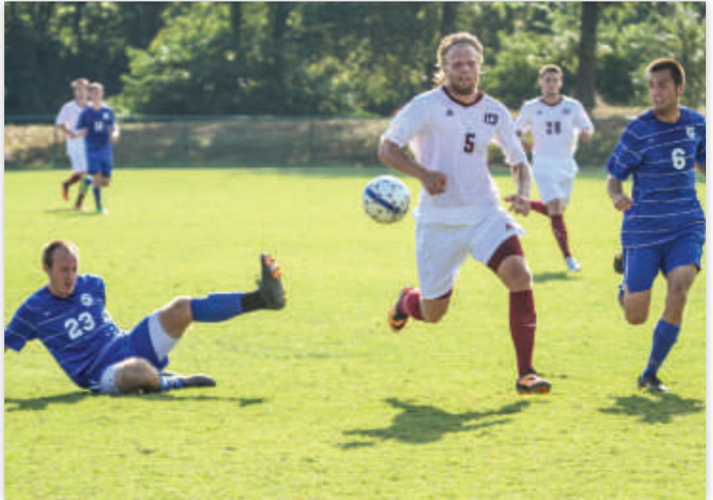
LU-Belleville men's soccer finished with a record of 12-5-2.