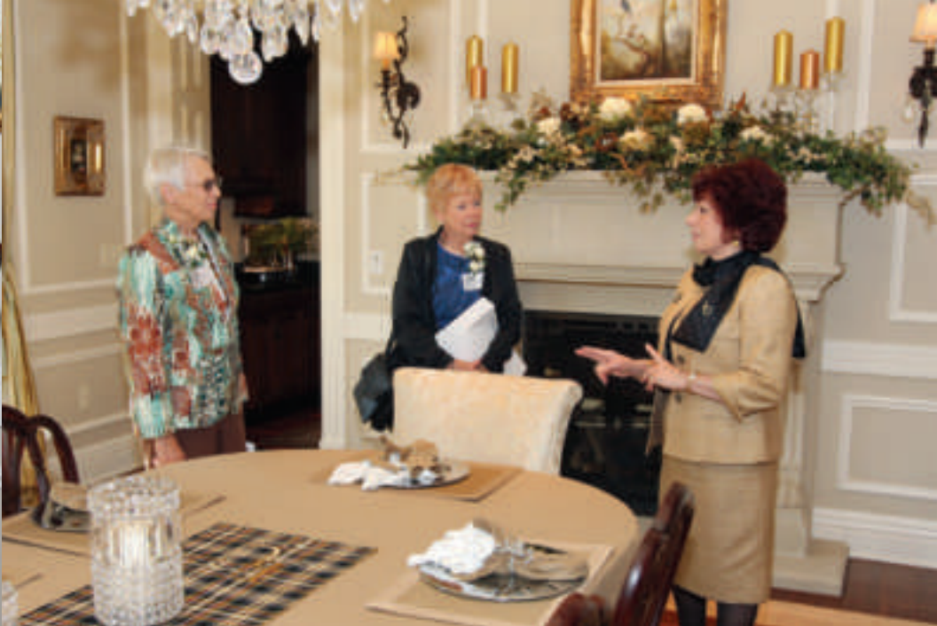
Guests signed in for the popular Lindenwood House tour.