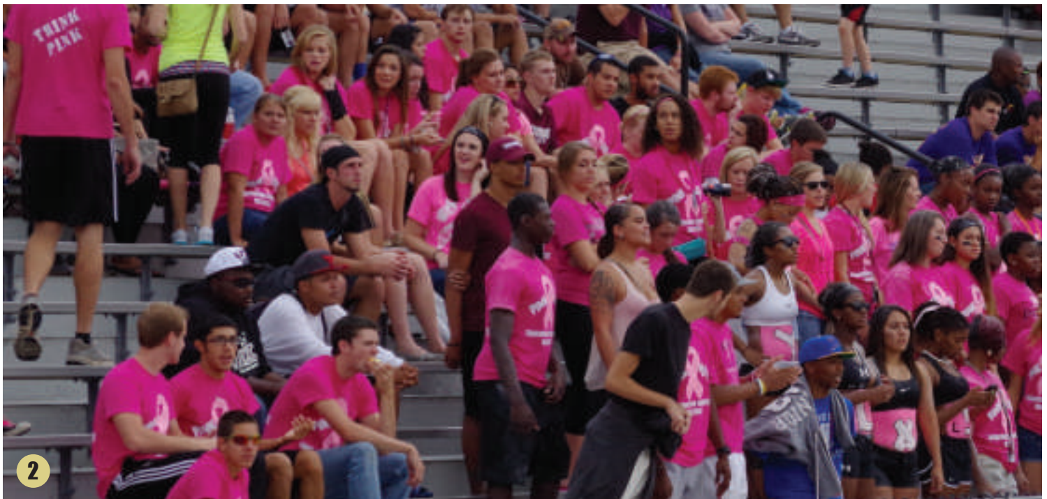
2. Hundreds of fans gathered to watch the Homecoming football game. The game was dubbed a “Pink Out” game in recognition of Breast Cancer Awareness Month.