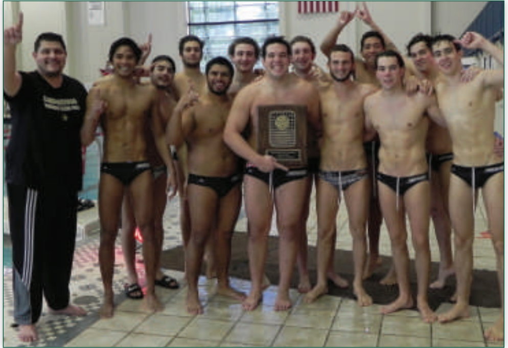
The men's water polo team won its second consecutive conference championship this fall.

The Lady Lions rugby team swept through the newly formed Thunderbird South Conference with a perfect 4-0 record. In only the third season for the program, Lindenwood defeated Iowa State University 22-17 in overtime in the first round of the conference playoffs at home October 26, but a road trip to Cedar Falls, Iowa, the following week ended the quest for the championship in the semifinals. The Lady Lions fell to Minnesota 29-15. With the season in the books, Lindenwood looks forward to the beginning of the new season in January.