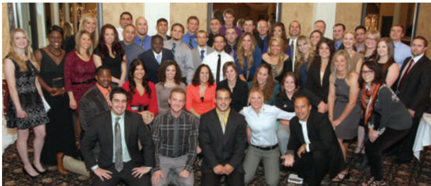
The 2013 class of the Lindenwood University Sports Hall of Fame