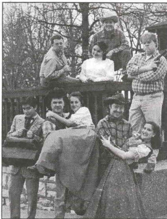
Principle cast from the Lindenwood University production of "Oklahoma!"