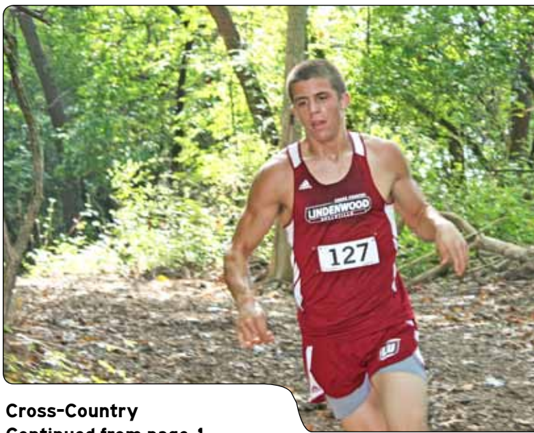
Cross-Country Continued from page 1 . . .

Lindenwood-Belleville Athletics competes in the United States Collegiate Athletics Association. Currently, the University is ranked number one in the USCAA Director's Cup standings that rate each school's athletic success as a whole.