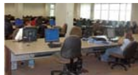
Spellmann Center Computer Lab