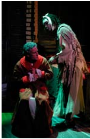
'A Christmas Carol,' an LU tradition.