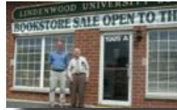
Spirit & Supplies Shoppe