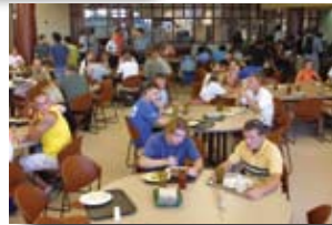
Spellmann Campus Center Café