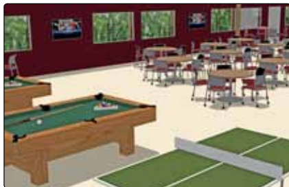
Pool Tables and Ping Pong Table

Lindenwood University-Belleville has announced that its new student center on campus will be named after former United States Senator Alan J. Dixon.