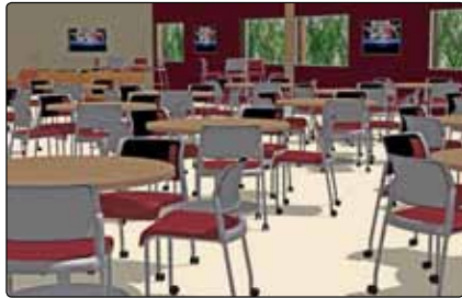
Dining and Meeting Area