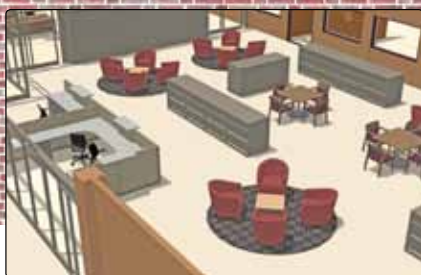
Library, Soft Seating & Information Desk