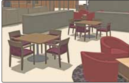
Bookshelves and Study Tables